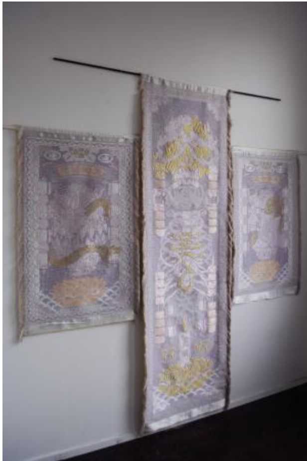
Three Contemporary Prosperities, 2023 Industrial Jacquard Weaving , Installation

Chinese-Malaysian cultural background. He has become fascinated with the three popular Chinese gods of fortune: the Fú Lù Shòu ( ). Each of these three gods embodies a different form of fortune. Fú ( ) stands for prosperity or wealth; Lù ( ) for reputation or nobility, and Shòu ( ) for longevity or eternity. Kueh weaves these attributes into his works through written text, Chinese characters and symbols that refer to the excessive accumulation of wealth and influence by companies like Amazon and Facebook. Under these circumstances – what does it mean to wish someone wealth, reputation, and eternal life in today's world? Kueh takes a critical look at these blessings by depicting Fú as a millionaire, Lù as a social influencer, and Shòu as a post-human cyborg. As we continue our exploration of “prosperity” in the contemporary, we encounter a four-meter-long tapestry depicting the most supreme deity of the Chinese pantheon: the Jade Emperor ( , Yù Huáng Dà Dì). Here, we as viewers literally sit at the feet of this great emperor and, as the title suggests, Under God's Eye places us right beneath his gaze. Kueh deliberately shows only the back side of the work, where the colors are decidedly more muted and the weave threads more fluid and painterly. In this tapestry the reverse side is especially less illustrative – becoming a scene where Kueh erodes the material notion of prosperity in pursuit of the spiritual.