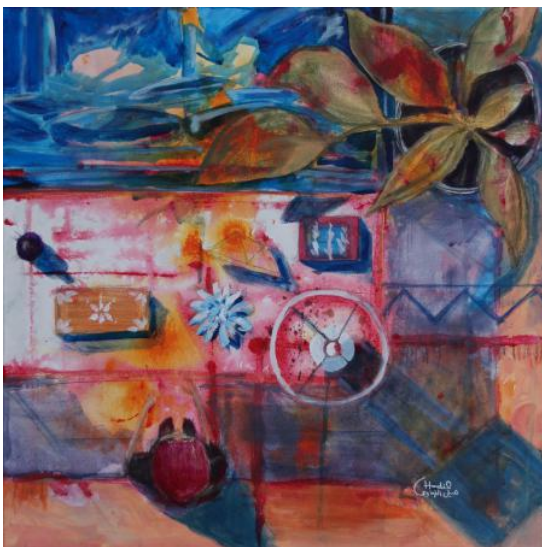
Fiddle, 2024 Acrylics and Crayon, 50 x 50cm