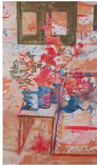
Marsam, Full Bloom, 2024 Acrylics and Crayon, 90 x 150 cm