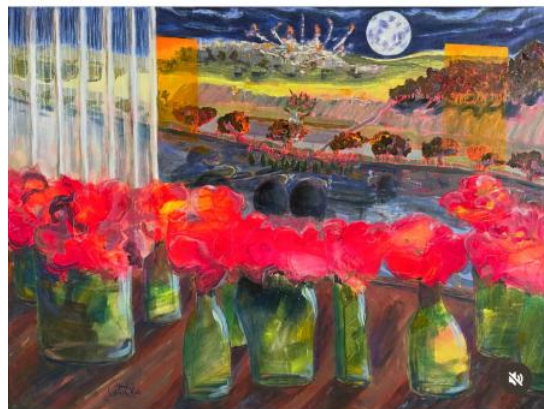
Dressed -REVAMPED, 2024 Acrylics and soft pastel, 100 x 75 cm