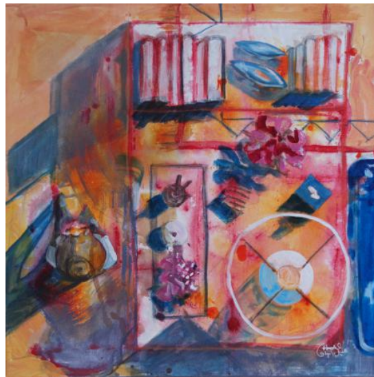
Flow, 2024 Acrylics and Crayon, 50 x 50cm