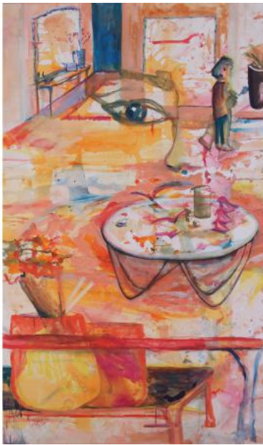
Marsam, Eye of the beholder, 2024 Acrylics and Crayon, 90 x 150 cm