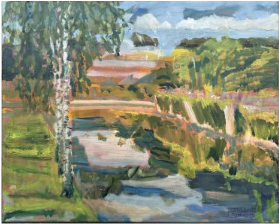
Den Haag's Texture, 2025 Oils, 50 x 40 cm

-- The Art People Gallery hong kong, Hongkong https://www.theartpeoplegallery.com