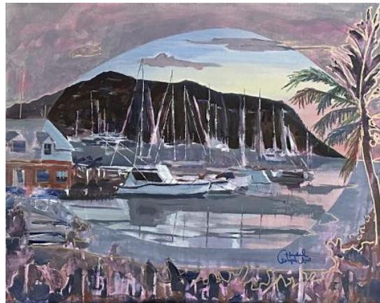
Evening at the Harbour, 2025 Acrylics, 50 x 40 cm