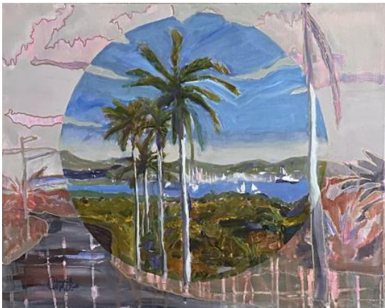
Driving Down to the beach, 2025 Acrylics, 50 x 40 cm