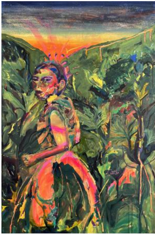
Sunsets, 2023 Oils and Collage, 60 x 90 cm