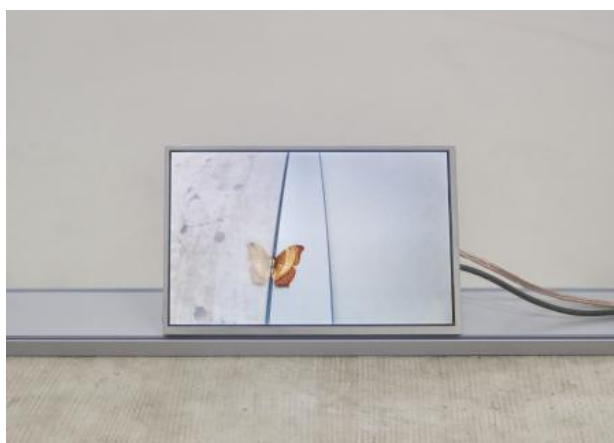
It folds until it breaks, it mirrors until it is whole, 2025 halve vlinder, glaspanelen, camera, LCD scherm, 180 x 180 cm