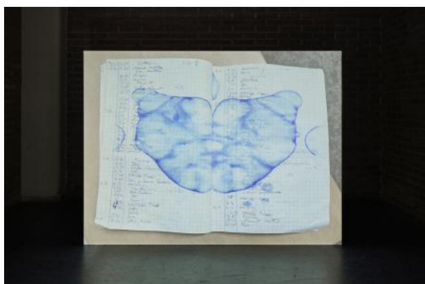
Plunge, 2025 één-kanaals video, 0:01, looped