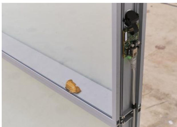
It folds until it breaks, it mirrors until it is whole, 2025 halve vlinder, glaspanelen, camera, LCD scherm, 180 x 180 cm