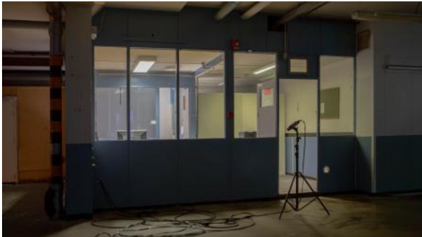
Besides,, 2024 installation, -