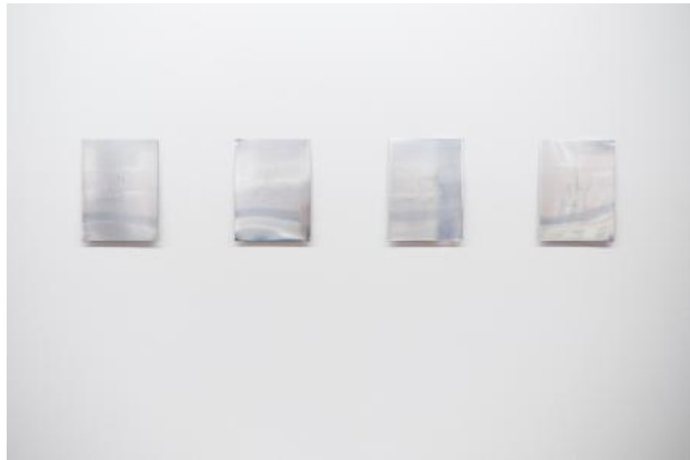
flies from the third floor, 2024 etchings, 20x85 cm