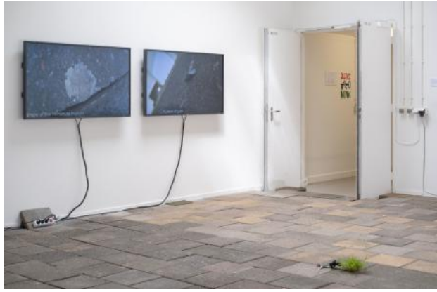
A piece of gum in the shape of a —, 2024 installation, -