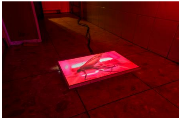
Tiny Death, 2026

accidents. This show aims to question the inside by going outside, challenging the dynamics of authority and the value of traditional exhibiting locations. The artists involved are sparked from industrial and performative matters.