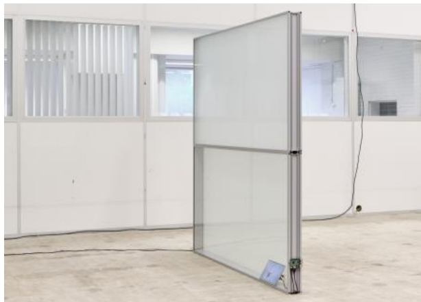
It folds until it breaks, it mirrors until it is whole, 2025