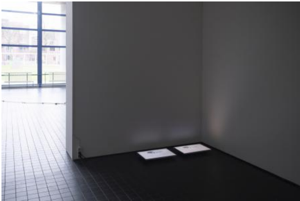
flies from the third floor, 2024 video installation, -