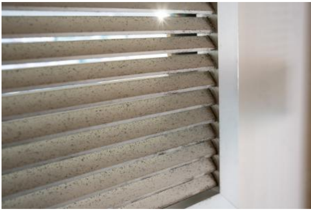
One-bedroom apartment, 2026 Installation, 3 square meters