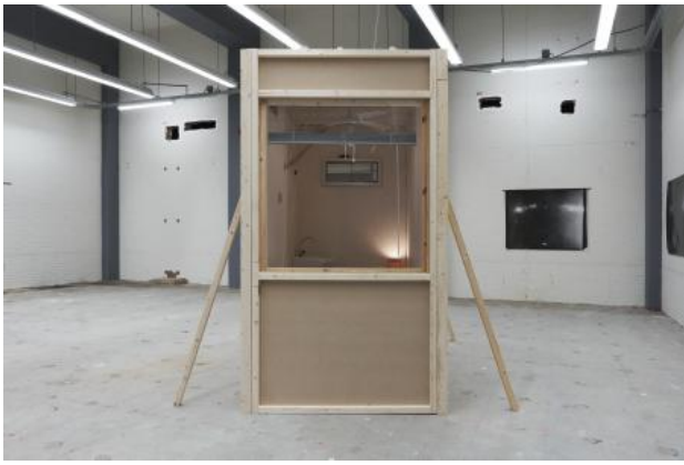
One-bedroom apartment, 2026 Installation, 3 square meters