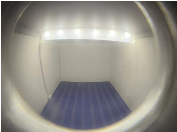
Dreamestate, 2026 Chipwood TV stand, textile, vertical blinds, paper, door viewer, LED lighting