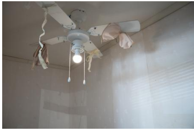
One-bedroom apartment, 2026 Installation, 3 square meters