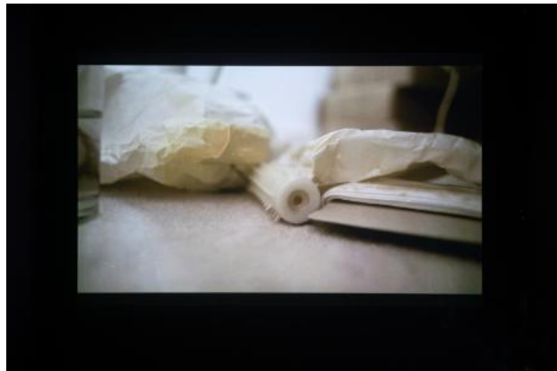
Cross-circulating, 2026 Video, 12:30 min