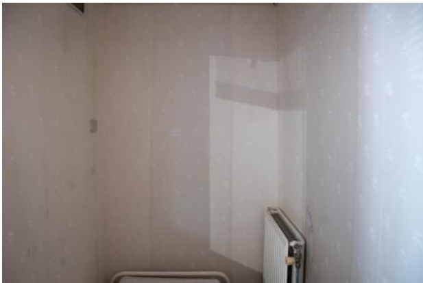
One-bedroom apartment, 2026 Installation, 3 square meters