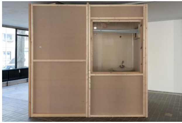
One-bedroom apartment, 2026 Installation, 3 square meters