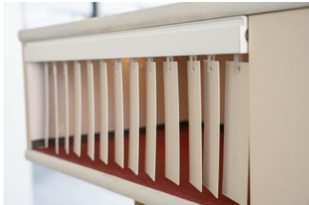
Dreamestate, 2026 Chipwood TV stand, textile, vertical blinds, paper, door viewer, LED lighting