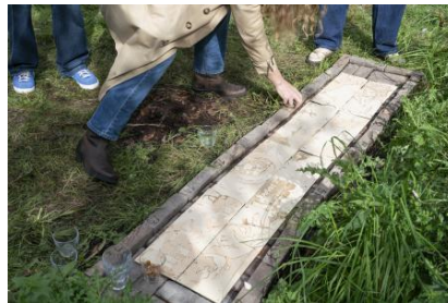
Het Ganzenspel van de Slotterplas, 2025 Handmade ceramic gameboard, drawings fired with Kaamera biopolymer., 180x30cm