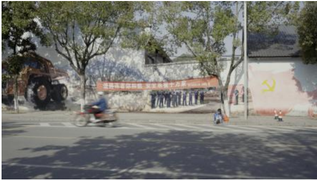
In The Trace of Tilled Stones, 2024 4K color