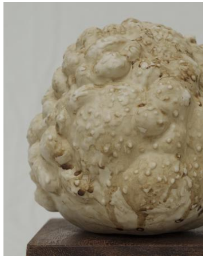
Nereda Lamp, 2026 Porcelain, Kaamera EPS coating, sapele wood, LED E27., W153 × H210 × D125 mm