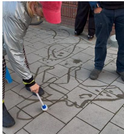
Wie woont er in de Slotterplas?, 2025 Workshop