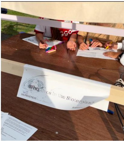
Wie woont er in de Slotterplas?, 2025 Workshop