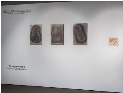
Kaamera Combustions - Exhibition view at NWO Life 2024, Egmond aan Zee, 2024 Kaamera bio-polymer silkscreen printed on steel, processed with flame, 60 x 40 cm