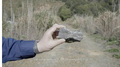
In The Trace of Tilled Stones, 2024 4K color