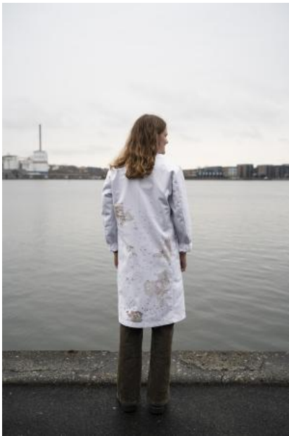
Signs of Wear, 2026 Silkscreen printing