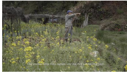
In The Trace of Tilled Stones, 2024 4K color