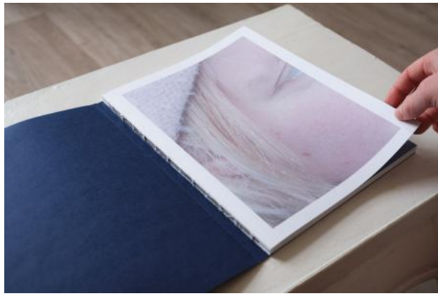
Warmth of the cold - Publication, 2023 Open swiss binding with Silk Screen printed cover. , 25 x 20