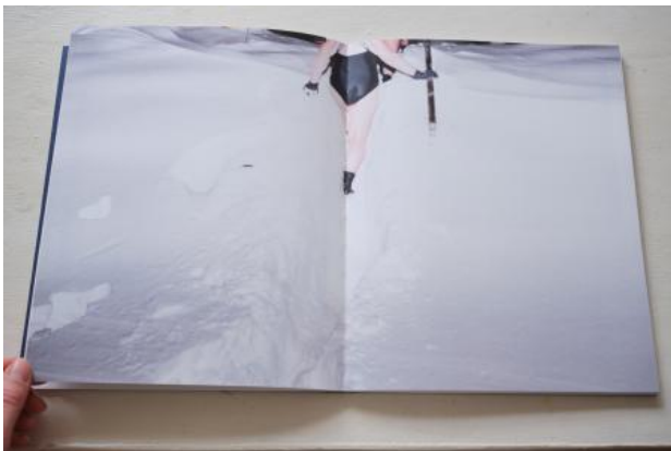
Warmth of the cold - Publication, 2023 Open swiss binding, 25 x 20