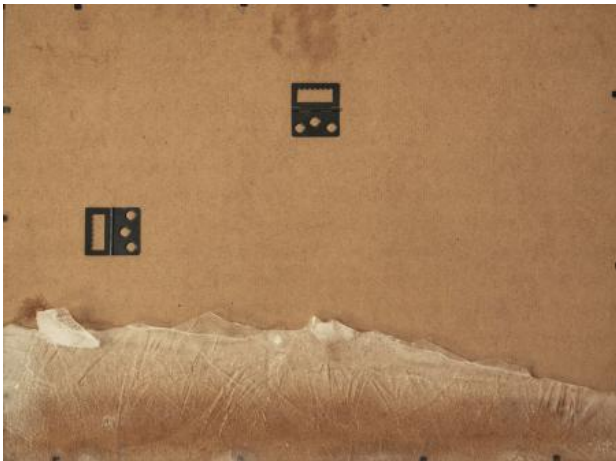
How to frame the cold?, 2023 digital photograph printed on munken paper and mounted., 42cm x 29cm