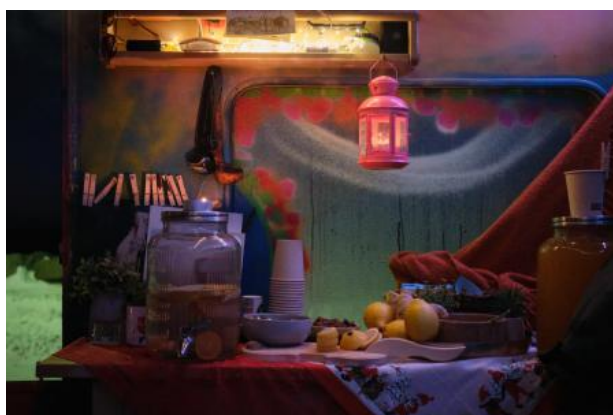
Moving Sauna, 2024 Digital Photograph, 42cm x 29cm