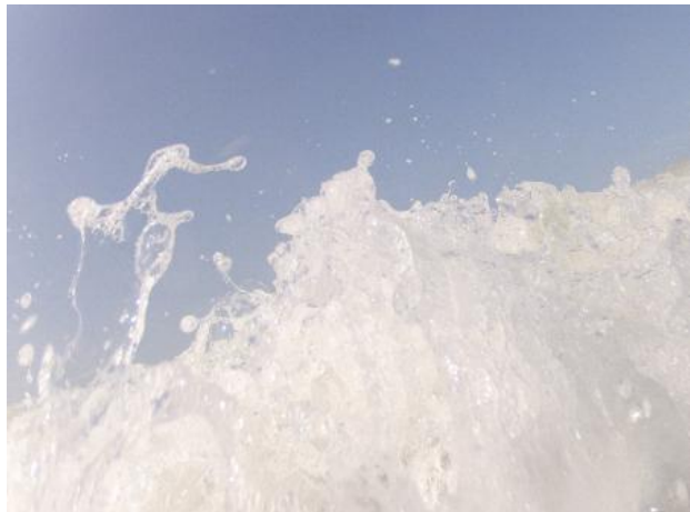
'Sjórin segir aaaa', 2023 Go Pro underwater camera attached to a head., 21 x 14,8