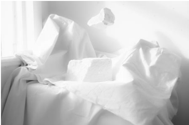
Sometimes up, sometimes down , 2022 Printed on glossy paper, in self made wood frame, 127cm x 88cm x 5cm