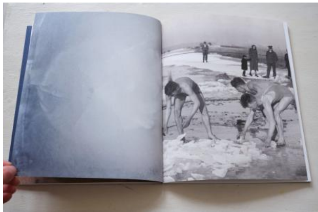
Warmth of the cold - Publication, 2023 Open swiss binding, 25 x 20