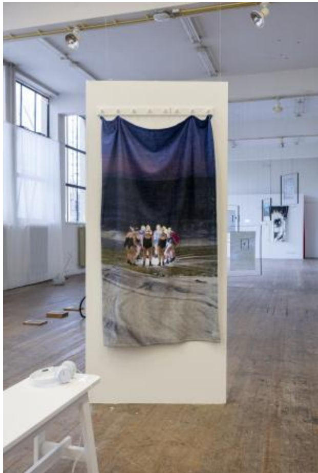
Warmth of the cold - Towel, 2023 Sublimation printing method., 140 x 90