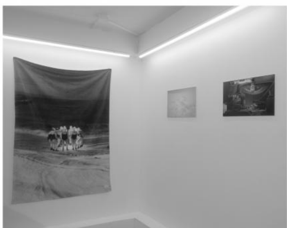
Exhibition view, Litla Gallery, 2024 sublimation printing method, digital photographs printed on munken paper and mounted.