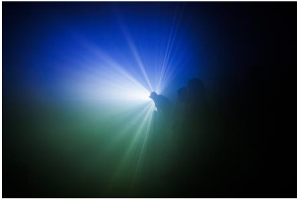
I hate indifference, 2024