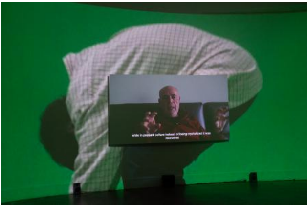
I love my land, 2024