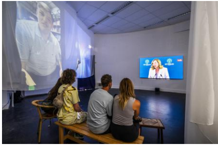
I love my land, 2024