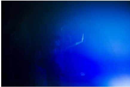
I hate indifference, 2024