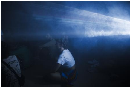
I hate indifference, 2024