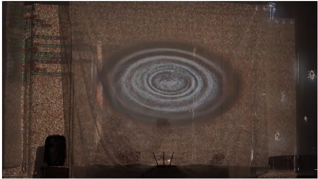
For Real not for Art, 2024