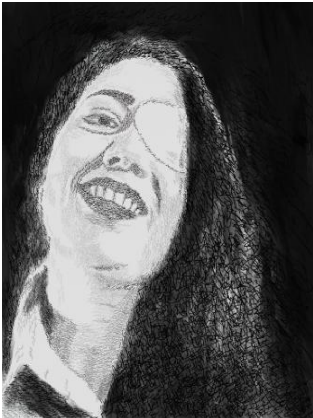
May the Heart That Fears Die, 2025 Digital drawing, text-based portrait