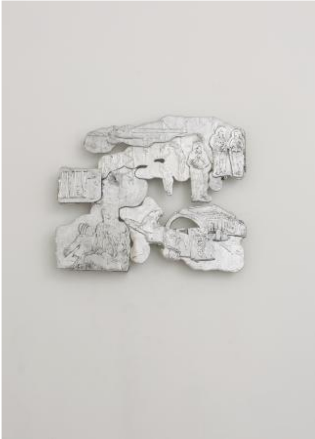
Remnant, 2025 Aluminium casting, 46 x 39 cm