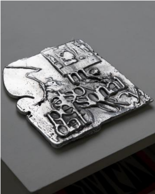
Privacy, 2024 Aluminium Casting, 16 x 14,7 cm