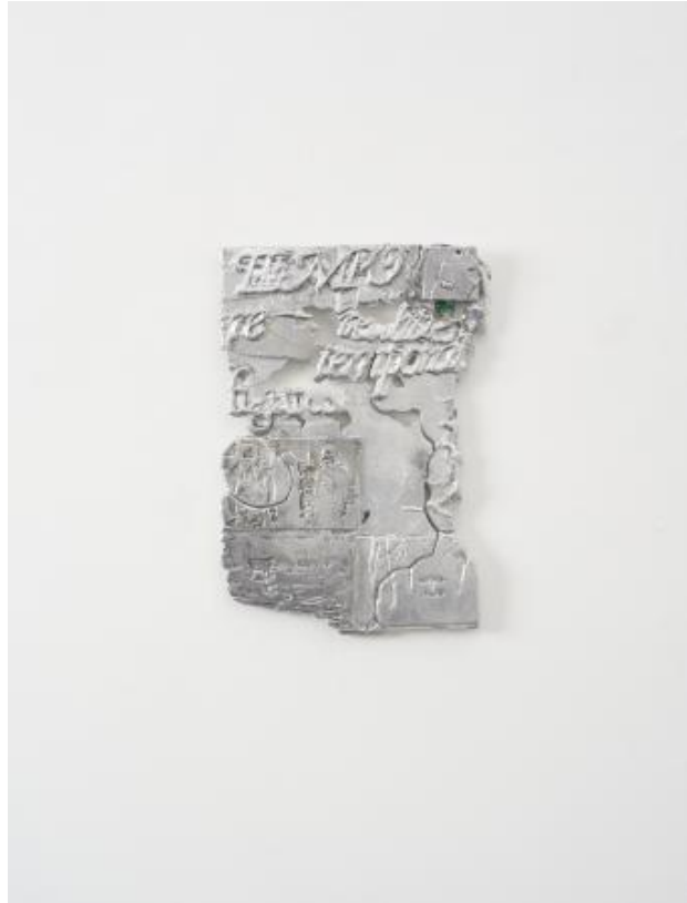
Tempo re-realities, 2025 Aluminium casting, 29,1 x 21,4 cm