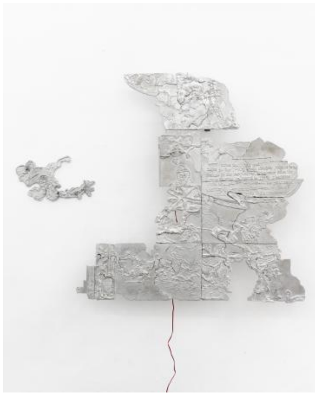
What to memorise? What to forget?, 2024 Aluminium Casting, 100 x 170 cm