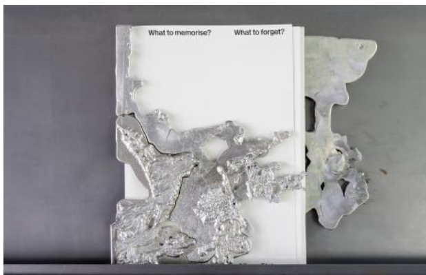
What to memorise? What to forget?, 2024 Aluminium Casting, digital print, 29,1 x 21,4 cm