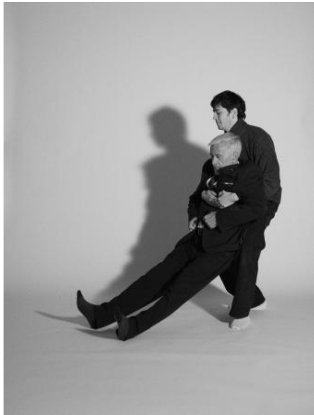
Building trust, 2024

The shape of our eyes, other things I wouldn't know, 2025 Art insallation