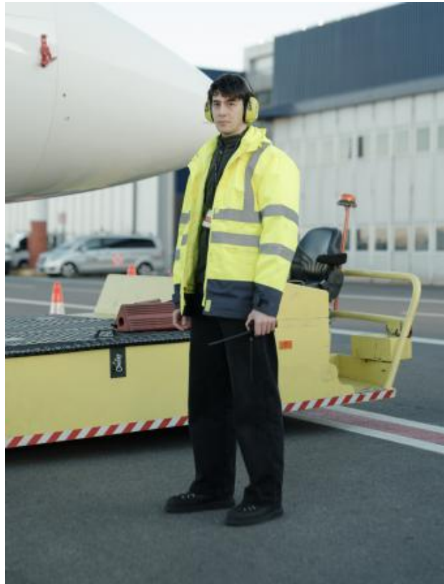
Imagining myself in your position, 2024