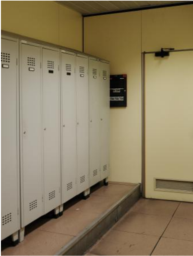
The place where you spend most of your time, 2024