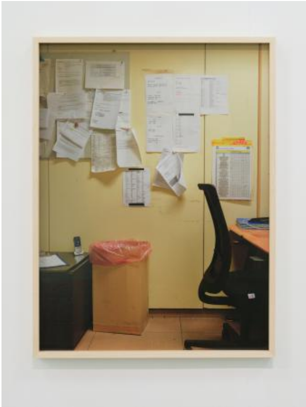
Looking at the place where most of your time is spent, 2025