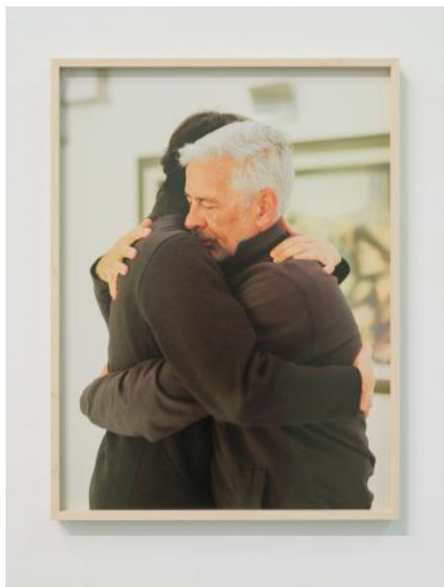
Embracing eachother, 2025

2025 Winner of the Luigi Ghirri Award Young Italian Photography Reggio Emilia, Italië 2025 Nomination for the Luigi Ghirri Award Young Italian Photography Reggio Emilia, Italië 2025 Selected for the PhotoMatch portfolio reviews at Fotofestival Łódź, Polen 2025 Selected for the PhotoMatch portfolio reviews at EXPOSED PhotoFestival Turin, Italië 2025 Shortlisted for Fotografia Europea + Skinnerboox dummy award 2024 Nomination for Steenbergen Stipendium 2024 Steenbergen Stipendium nominee Rotterdam, Nederland 2024 Selected for the Lighthouse Talent program FOTODOK, Utrecht Nederland 2024 Winner of Public Choice Award Steenbergen Stipendium, Rotterdam (NL) Nederland