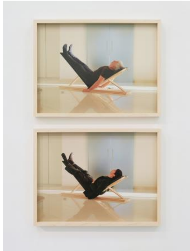
Mimicking the positions you take, 2025