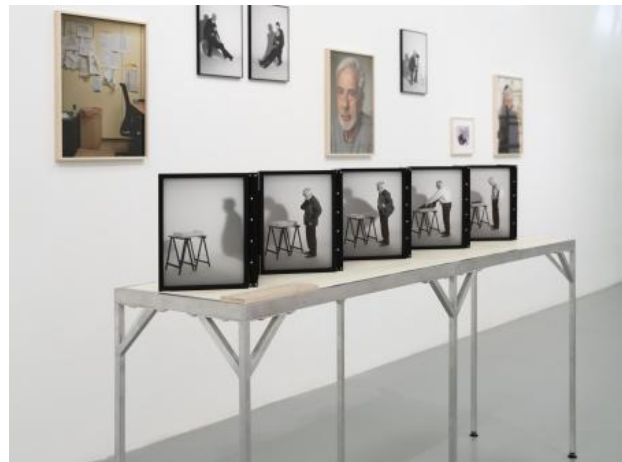
Wearing your uniform, 2025