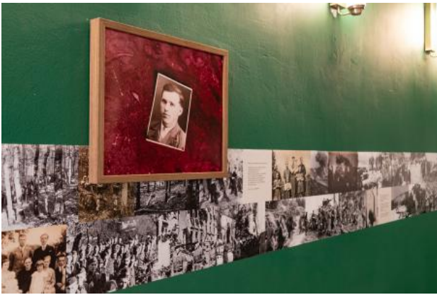
Kranj Foto Fest, 2025