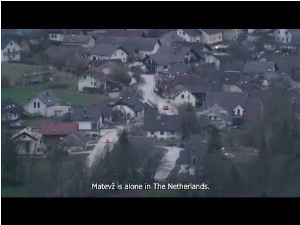
In the mountains, the sun is shining, 2024 18 min (2 minutes excerpt)