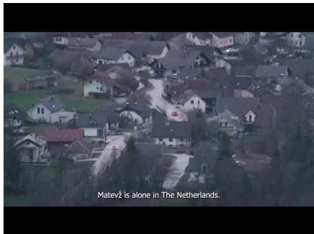
In the mountains, the sun is shining, 2024 18 min (2 minutes excerpt)