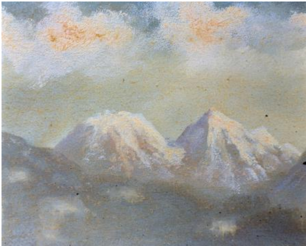
Mount Kočna and Grintovec