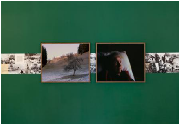
Kranj Foto Fest, 2025