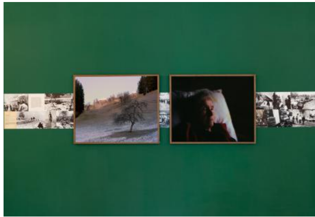
Kranj Foto Fest, 2025