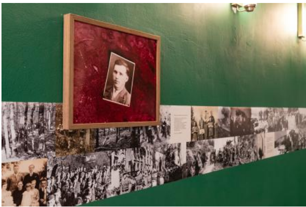
Kranj Foto Fest, 2025