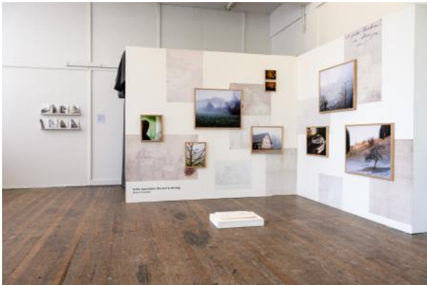
Graduation Show, Royal Academy of Art, The Hague, 2024