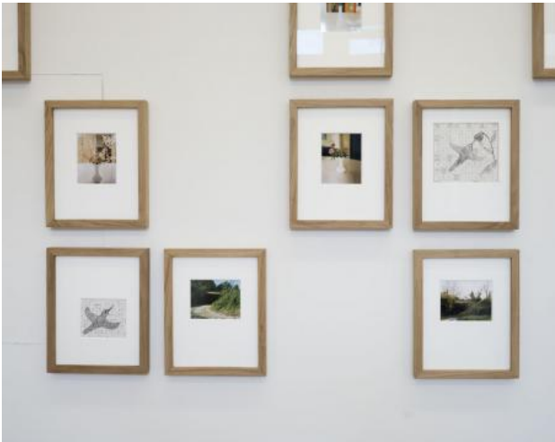
Her Forest, Tearless as Stone, 2024 Photography, C-print, 28x22 cm