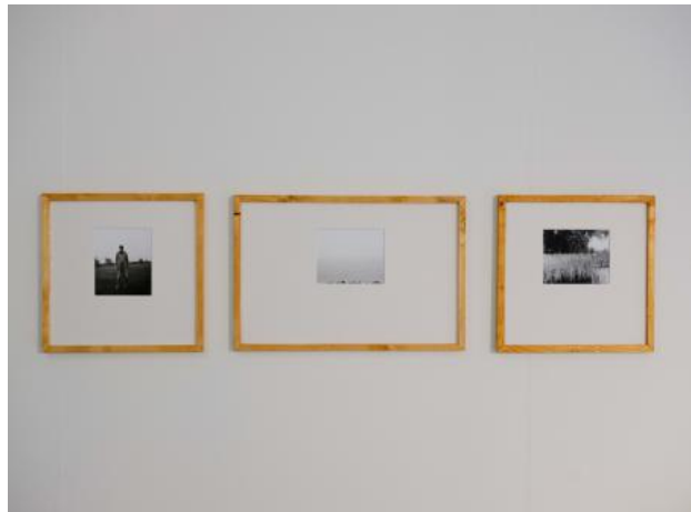
Mountain Never Meet but People Do, 2023 Photography, 40x40 - 40x60 cm