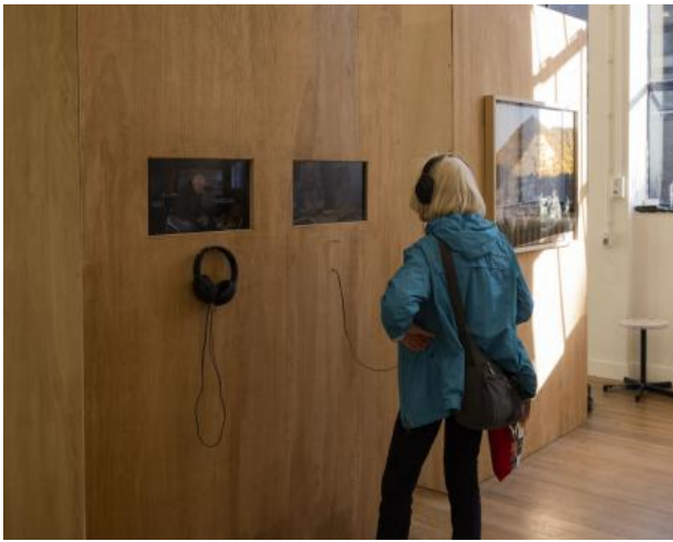
Her Forest, Tearless as Stone, 2024 Video