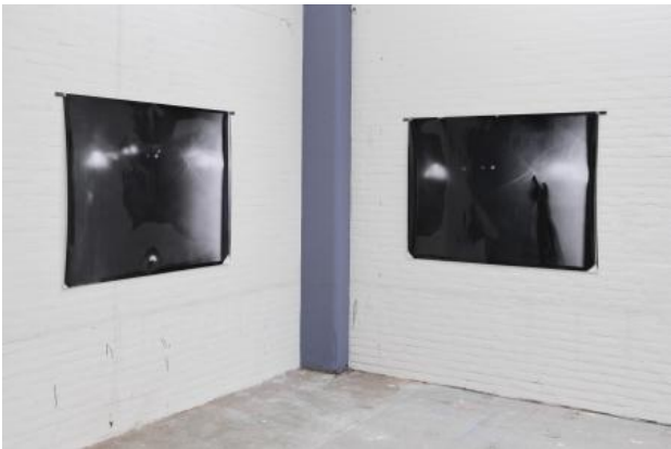
The coldest day of the year, 2026 Silver gelatin print , 106x140 cm