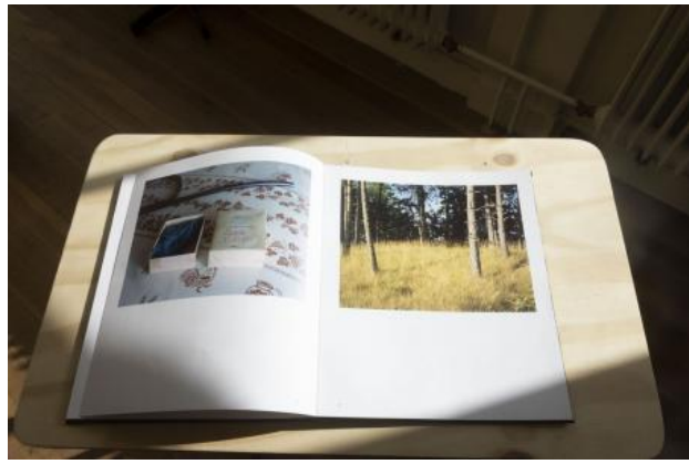
Her Forest, Tearless as Stone, 2024 Photobook