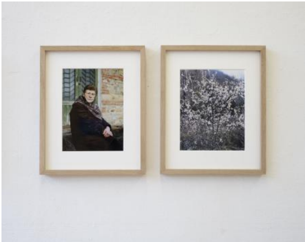
Her Forest, Tearless as Stone, 2024 Photography, C-print, 40x50 cm