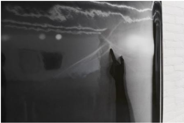
The coldest day of the year, 2026 Silver gelatin print , 106x140 cm