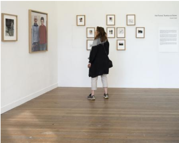
Her Forest, Tearless as Stone, 2024 Photography, C-print