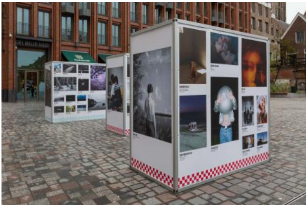
Regenerate , 2023 Photography