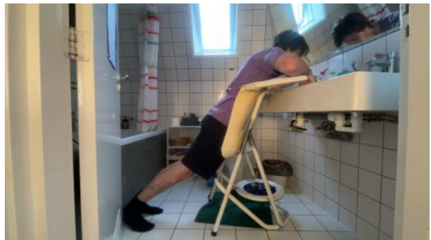
Domestic Daydreams, 2024