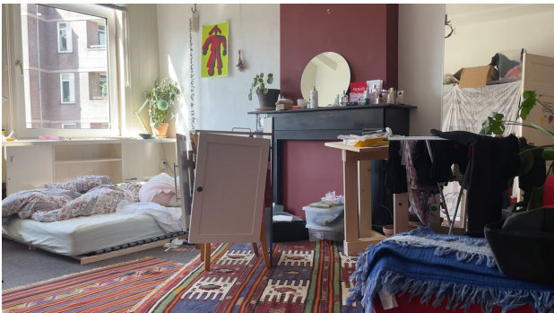
a thing for inbetween clothes, 2024 03:06