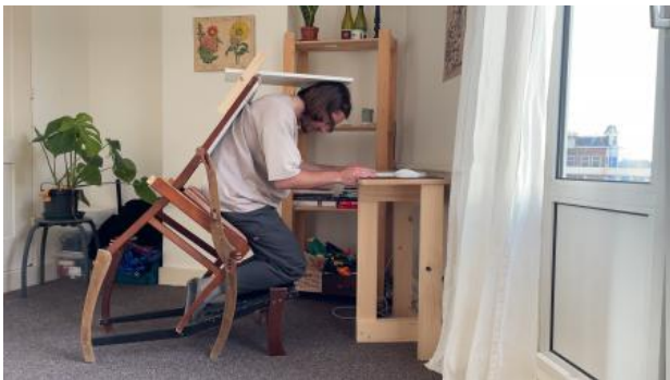
Domestic Daydreams, 2024