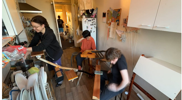
Brancheed table_final, 2024 03:40