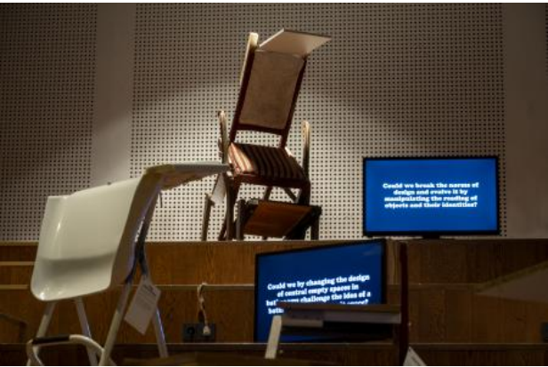
Domestic Daydreams, 2024