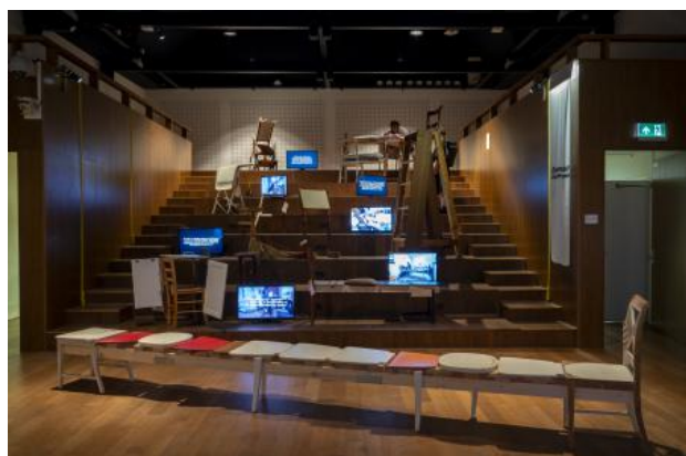
Domestic Daydreams, 2024