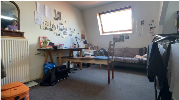
Long Chairmp4, 2024 03:50