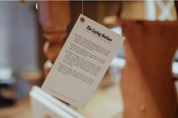
Domestic Daydreams, 2024