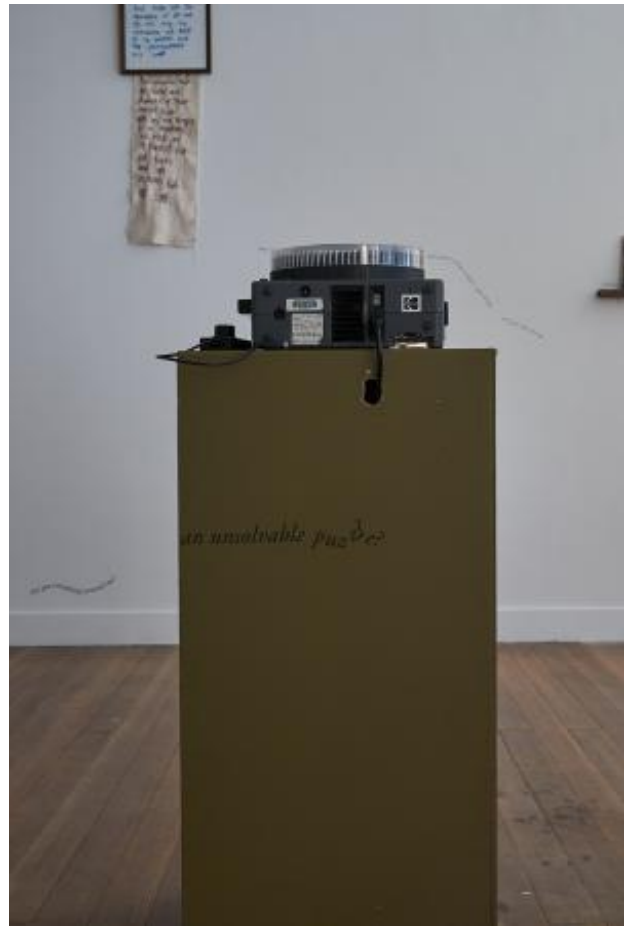
My present is more than I remember , 2023