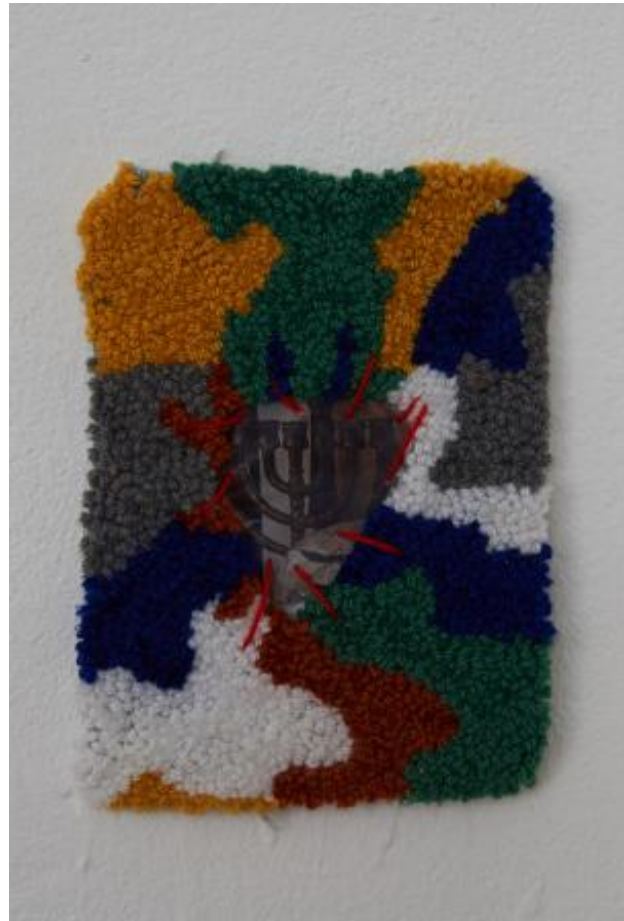
Lost objects , 2023 Photo print framed in punch-needled rug, 21x15cm