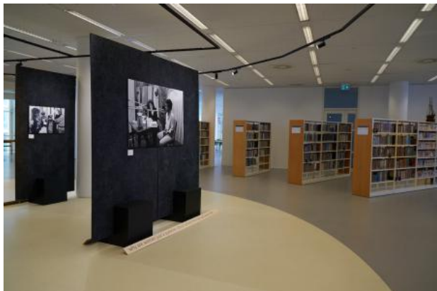
, 2024 text on wooden panels