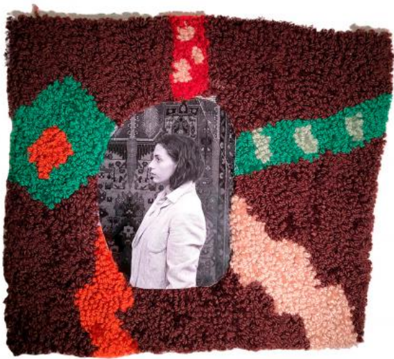
A carpet in a carpet is an image. , 2023 Photo print framed in punch-needed rug. , 23x28cm