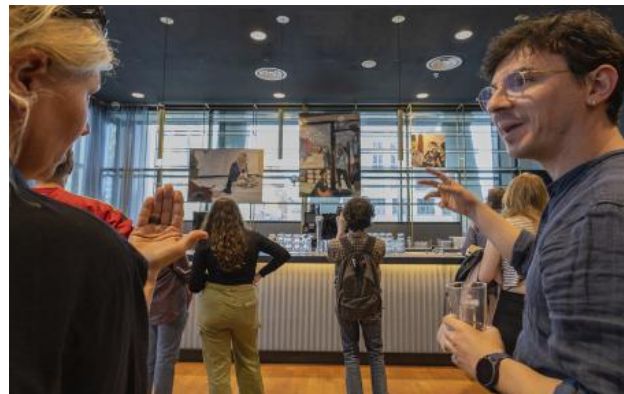
Artists work in horeca: 'In the shelves above the bars' , 2023