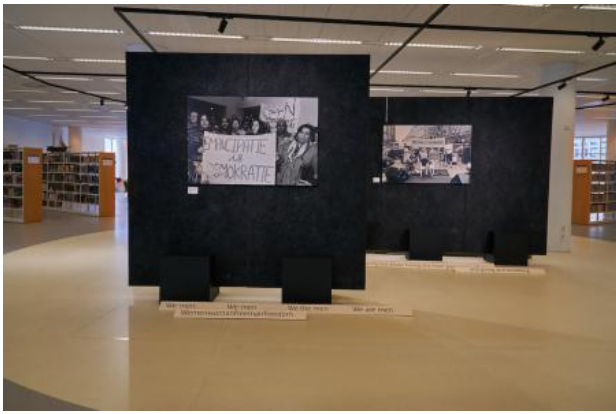
, 2024 text on wooden panels