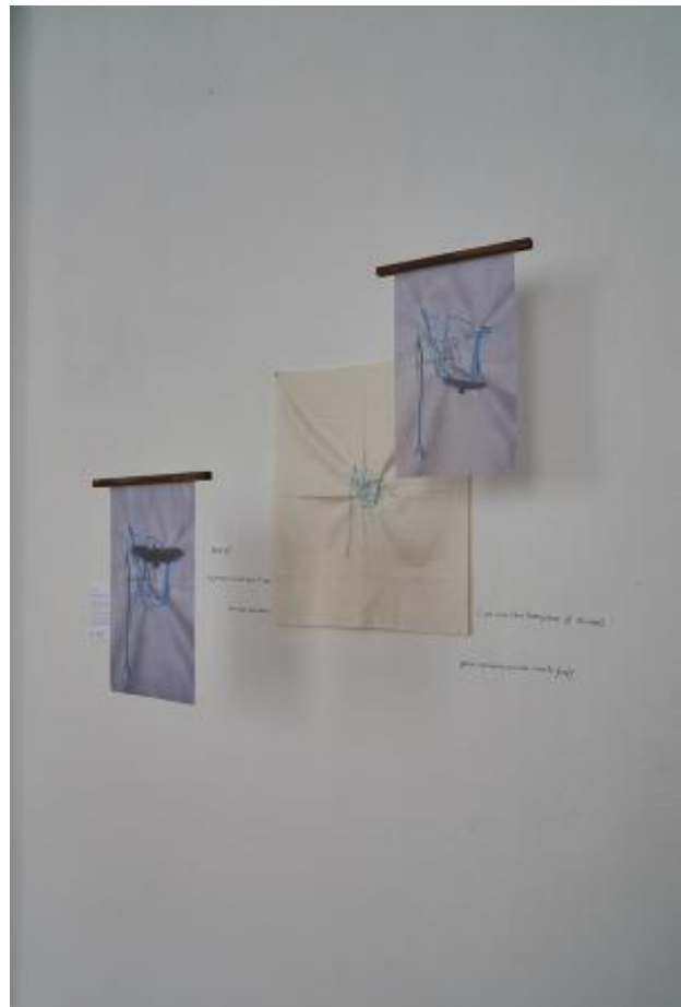
My present is more than I remember, 2023