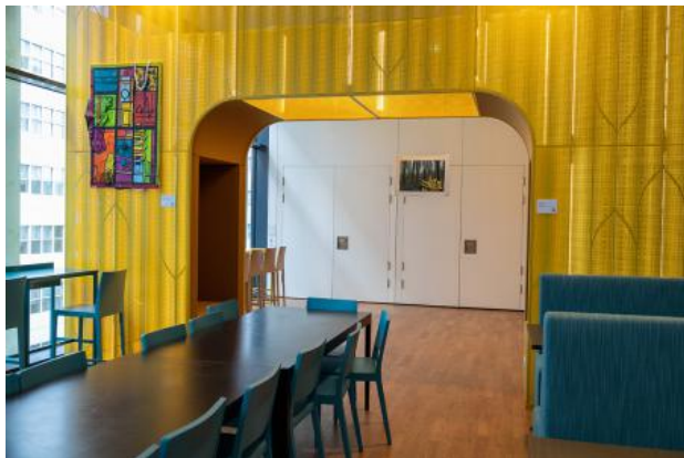
Artists work in horeca: 'In the shelves above the bars' , 2023 photo print sewn onto unbleached cotton.