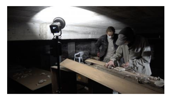
excavation of basement, 2023 film still, film still