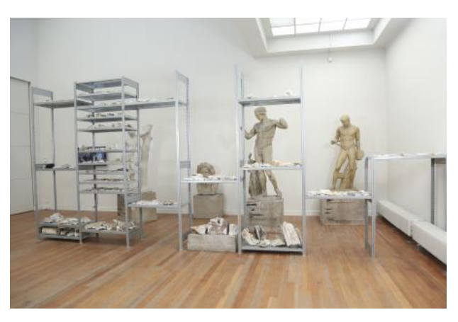
excavation gips collection, 2023