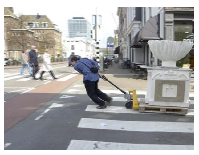
walk with founatin, 2023 happening/ performance, still from film