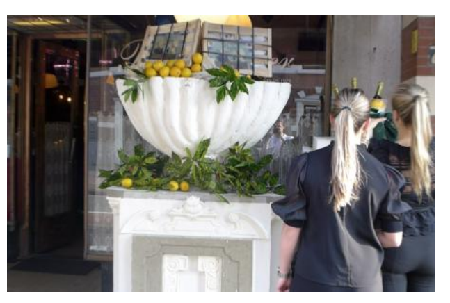
oyster party on the founatin, 2023 happening/ unannounced , still from film, documentation of moment