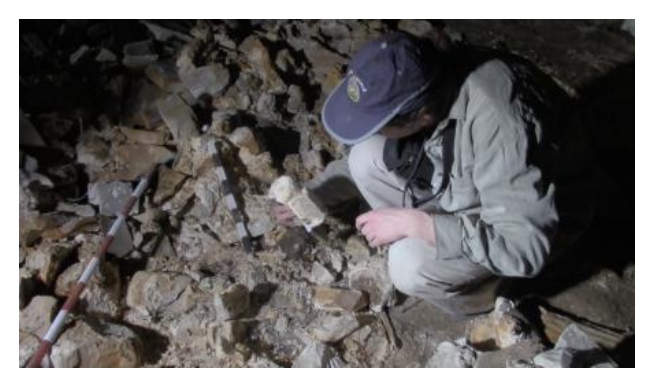
film still excavation, 2023 still, still