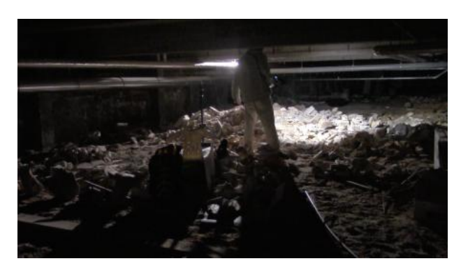
film still excavtion, 2023 film still, film still