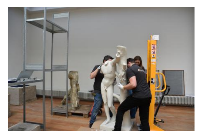
process of returning Gips collection, 2023 happening, film still of a moment