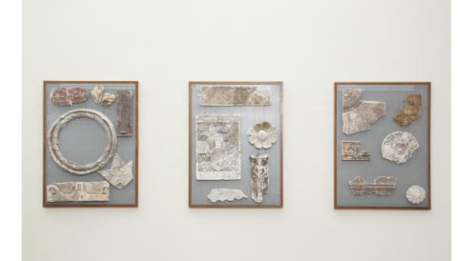
re-constructed plaster fragments, 2023 excavated plaster reassembled and mounted on metal, each 100x80cm