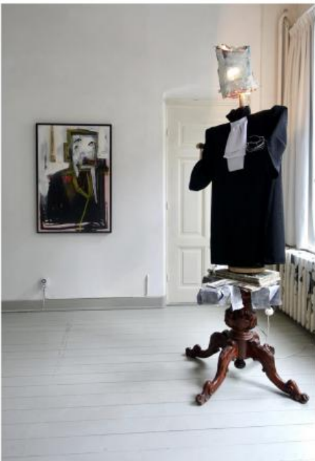
M.E (Metaphorical Existence), 2025