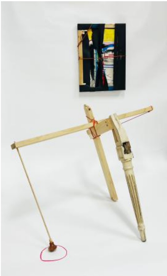
EQUILIBRIO LIBERADOR , 2024 Acrylic, Canvas, Wood, Rope