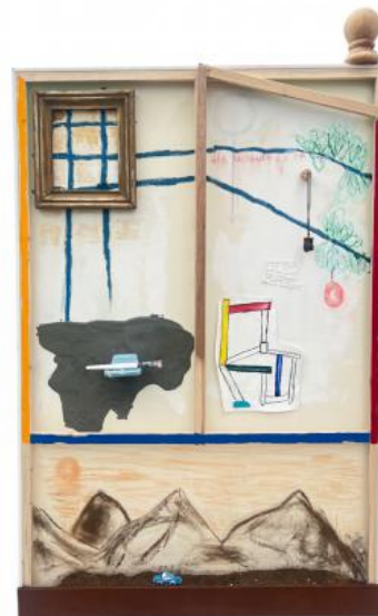
Framing Memorias, 2025