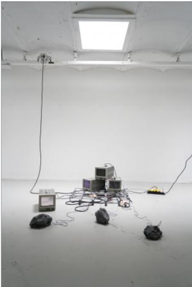
Untitled performance, 2023 Clay, monitors, performance