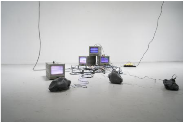
Untitled performance, 2023 Clay, monitors, performance