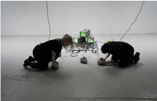
Untitled performance, 2023 Clay, monitors, performance