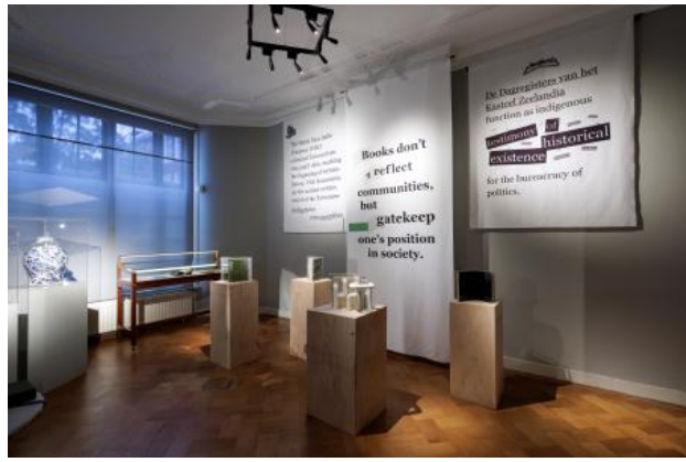
Four More States, 2025