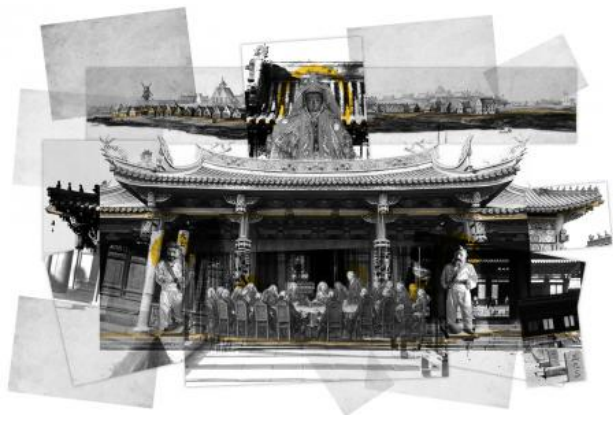
Defining Divinity, 2024