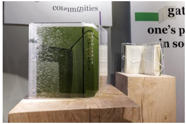
Four More States, 2025