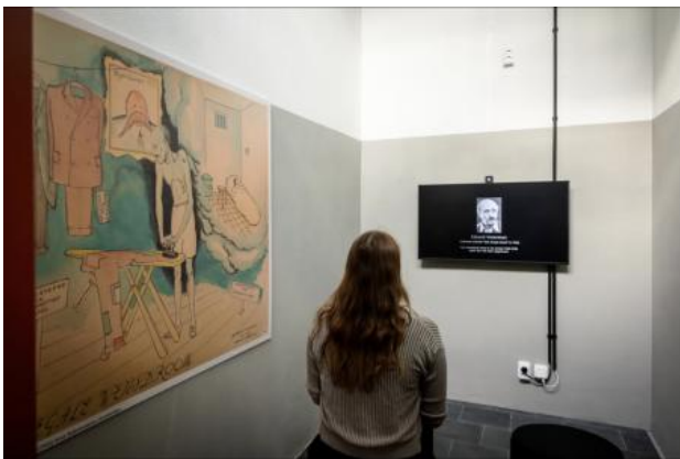
Hoe de muren klinken, 2025