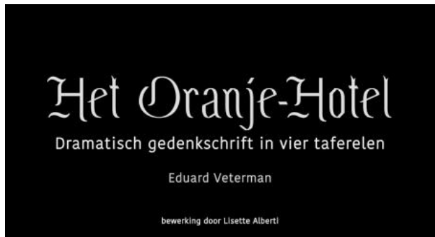
Hoe de muren klinken, 2025