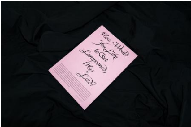
How Would You Like to Get Lampooned, My Lord?, 2022