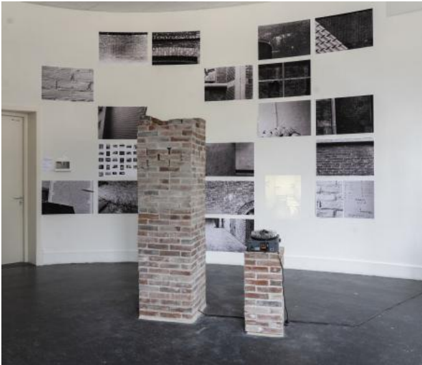
The Bricks Keep the Record, 2023 Brick, paper, audioscape