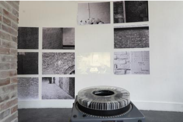
The Bricks Keep the Record, 2023 Brick, paper, audioscape