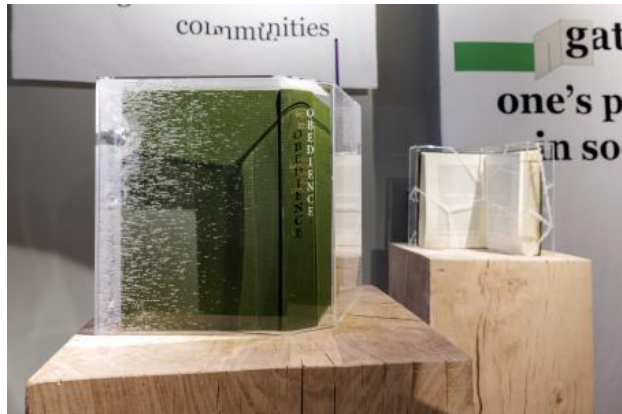
Four More States, 2025