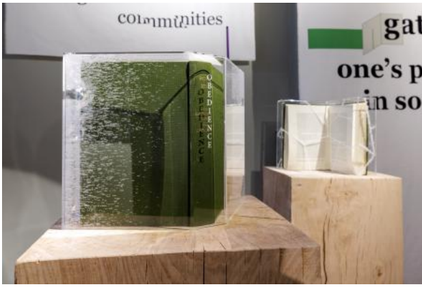
Four More States, 2025