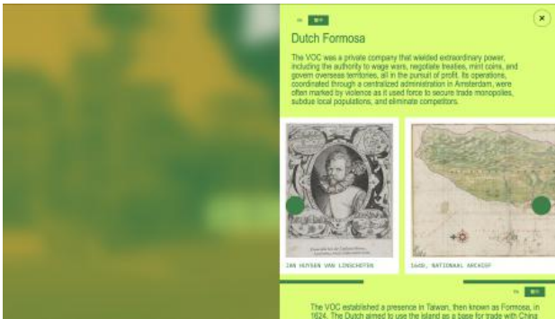
Defining Divinity, 2024