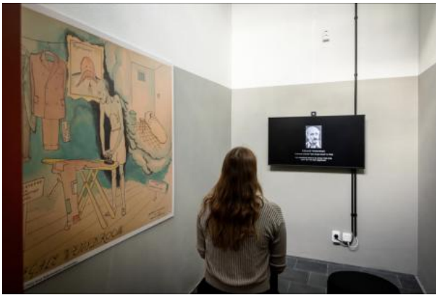
Hoe de muren klinken, 2025