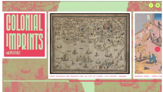
Defining Divinity, 2024