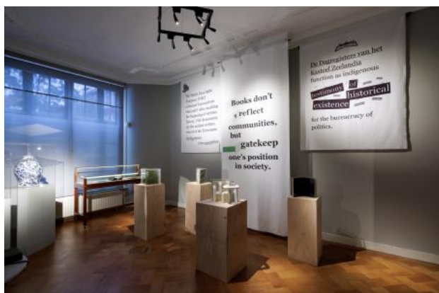
Four More States, 2025