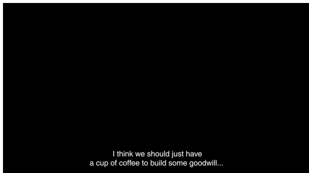
Video door Touchy Studios, 2026 06:50