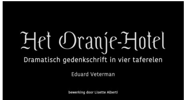
Hoe de muren klinken, 2025