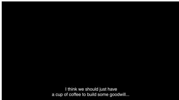
Video door Touchy Studios, 2026 06:50