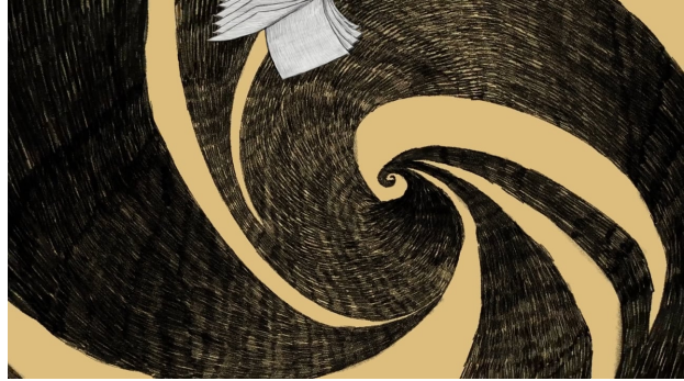
Garbage Mansion, 2025 2:11