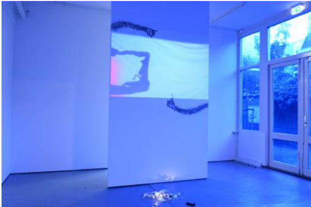
Fruit de Mar, 2023 video work, paper, shadows, crayon on wall.