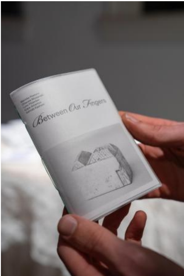
Book Launch of 'between our fingers', 2026 publication, 130 x 90 mm