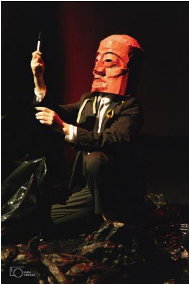
Garbage Mansion, 2025