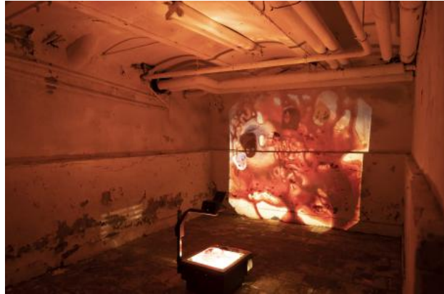
Paper Whispers, 2023 ink, overhead- projector, paper mache masks.