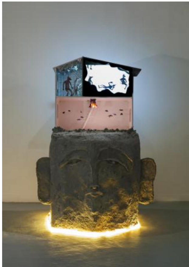
Bad Objects, 2024 paper mache, soda can, polymer clay, video projection, 150 x 70 x 50 cm