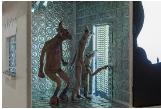
Bad Objects, 2024 paper mache, soda can, polymer clay, video projection, 150 x 70 x 50 cm