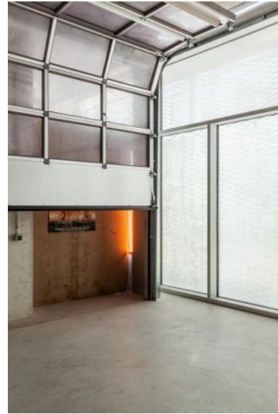
Machine-Gun-Fire Like Crying, 2023 inkjet print, wood, lights, garage door