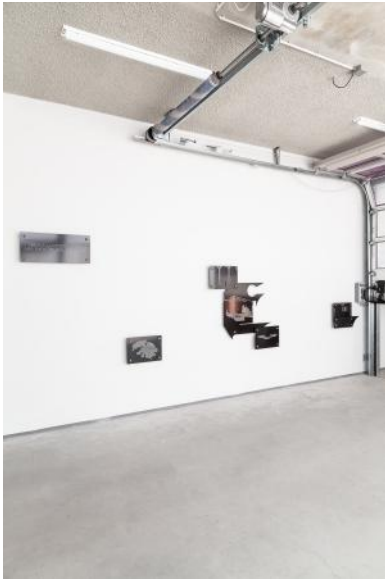
Ferocious Molten Metal Has The Potential To Prevail, 2023 laser-cut and powder-coated steel