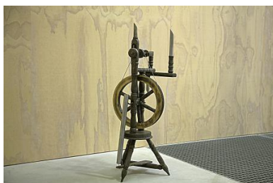
Rokka with Metallic-Hard-Ware-Prósthetsics, 2022 spinning wheel, metal, stainless steel wire