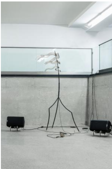
Alagya - Landmark, 2022 metal, laser-cut and thermoformed acrylic, sound