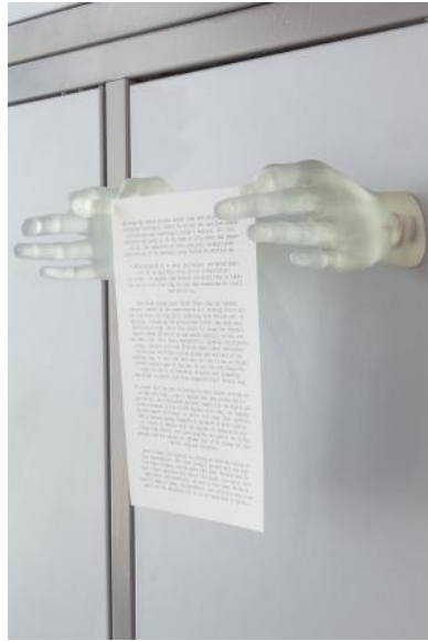
Metallurgia, 2023 transparent resin print, paper