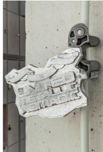
United, Metallic, Nomadic, 2023 cast aluminium, motorcycle dashboard holder