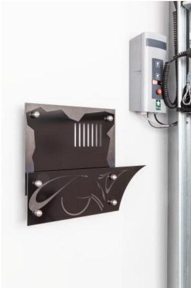
Ferocious Molten Metal Has The Potential To Prevail, 2023 laser-cut and powder-coated steel