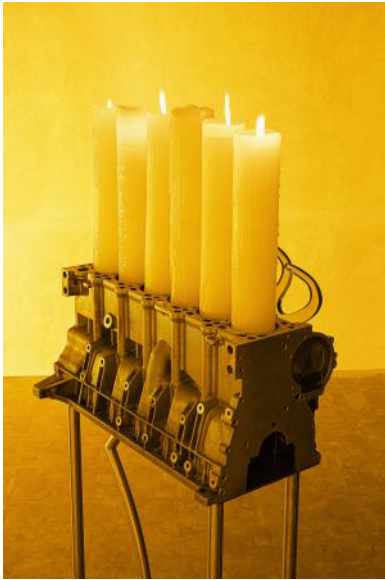
Alagya - Bambi, 2021 metal, engine block, laser-cut and thermoformed acrylic, candles, fire