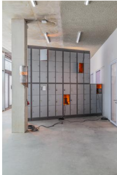
Metallurgia - United, Metallic, Nomadic, 2023 lockers, metal, transparent resin print, lights