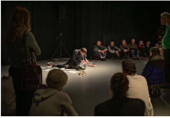
MOANS OF A VACUUM CLEANER, 2025 Choir performance with human, house appliances, plaster coated images and 3d sculptures