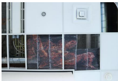
OUTSIDE THE HOSPITAL DOORS, 2024 Metal grid with scotch tape intertwined, Variable dimensions using A4 as a module