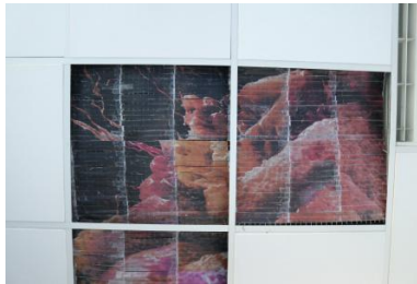
OUTSIDE THE HOSPITAL DOORS, 2024 Metal grid with scotch tape intertwined, Variable dimensions using A4 as a module