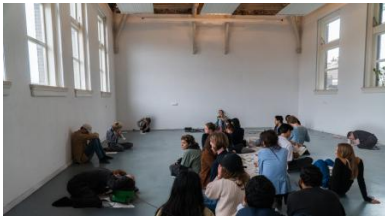
Collective moans of a vacuum cleaner, 2024 Choir with human and house appliances voices