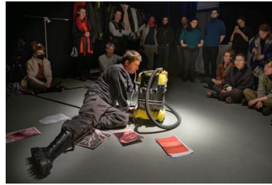
MOANS OF A VACUUM CLEANER, 2025 Choir performance with human, house appliances, plaster coated images and 3d sculptures