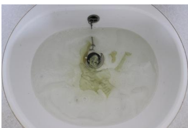
OUTSIDE THE HOSPITAL DOORS, 2024 3d printed sculpture made in resin,