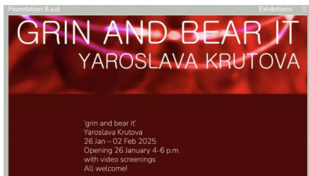
Grin and bear it, 2025 Mixed media