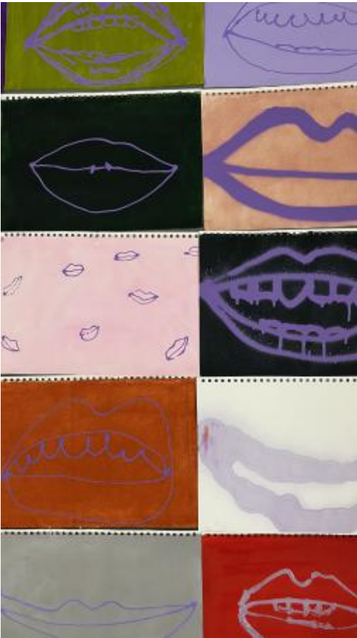
Grin and bear it, 2025