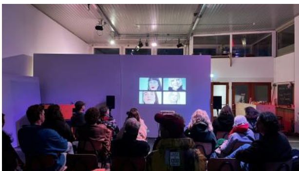
Grin and bear it, 2025 Short film