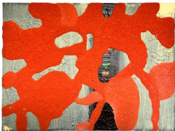
Manier, 2025 Combinatie van olieverf en acryl op canvas, 30*40