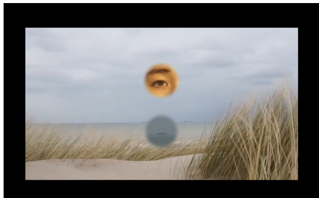
I don't want to speak english anymore , 2020 7:44