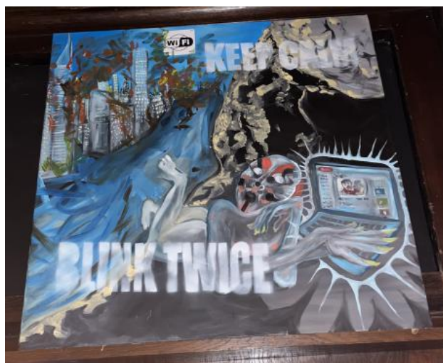
2021, 2022 Oil and spray paint on Canvas, 1M X 1M