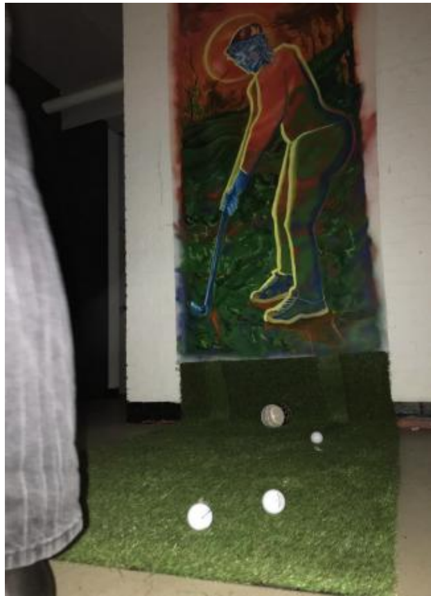
2020, 2021 oil on canvas , 200 cm x 50cm