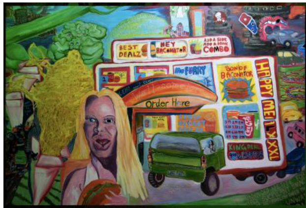
2020, 2022 Oil on Wood with engraving , 200 cm x 160 cm