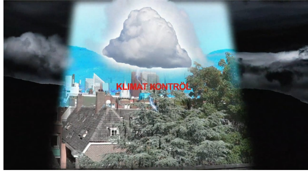
Climat Kontrol , 2022 12:17