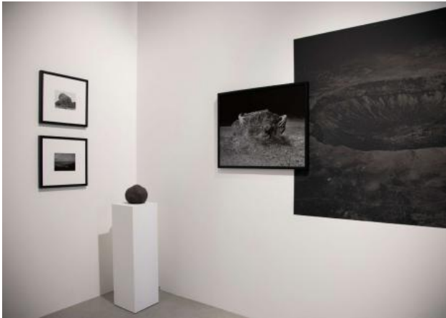
Dior x Luma award exhibition, 2024 Fine art photographic prints in wooden frames, fine art photographic wallpaper, sound installation with a ceramics "murmuring rock" sculpture and a sound piece playing on a loop from inside the rock.