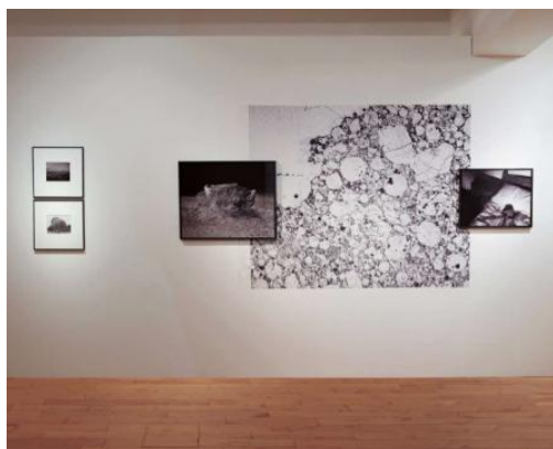
Athens Photo Festival at Benaki Pireos 138, 2024 fine art photographic prints in the wooden baking frame, fine art photographic prints in the passe partou frame, fine art photographic prints.