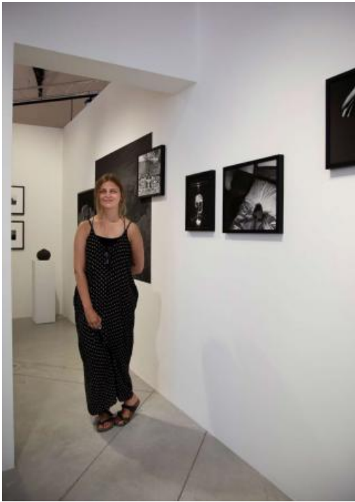
Dior x Luma award exhibition, 2024 Fine art photographic prints in wooden frames, fine art photographic wallpaper, sound installation with a ceramics "murmuring rock" sculpture and a sound piece playing on a loop from inside the rock.