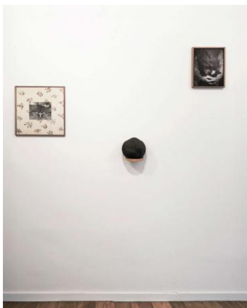
As we drift in the simmering pot things boil under the lid, 2024 hand made pass-partou fine art photographic print in a wooden frame, a photographic fine art print in the wooden frame, a ceramic glazed sculpture with a sound system inside