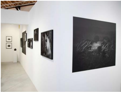
Dior x Luma award exhibition, 2024 Fine art photographic prints in wooden frames, fine art photographic wallpaper, sound installation with a ceramics "murmuring rock" sculpture and a sound piece playing on a loop from inside the rock.