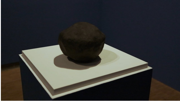
a "humming stone" , 2024 00:41