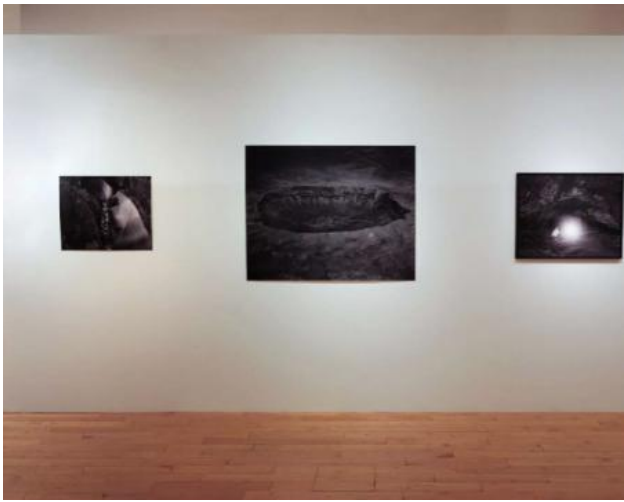
Athens Photo Festival at Benaki Pireos 138, 2024 fine art photographic prints in the wooden baking frame, fine art photographic prints in the passe partou frame, fine art photographic prints.