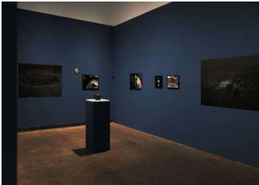
Boutographies festival solo exhibition, 2024 Fine art photographic prints in wooden frames, fine art photographic wallpaper, sound installation with a ceramics "murmuring rock" sculpture and a sound piece playing on a loop from inside the rock.