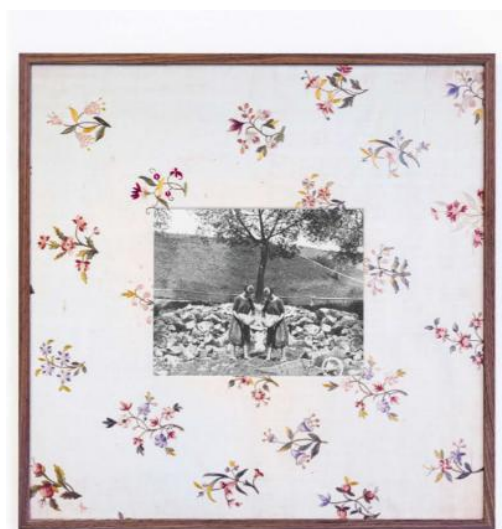
"godsips", 2024 tographic fine art print in the wooden frame