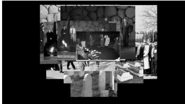
Put Another Wreath, 2022

4-kleuren Risodruk, Comcolor druk, digitale druk, tijdschriften, knipsels uit verschillende bronnen, gedroogde bloemen, snijbloemen, strokransen, bladgroen, "Deense" kar voor bloemenhandel, Fc 588, Fc 577 en Fc 566 wateremmers, Moiré-kranslint, franjes, T, variabel