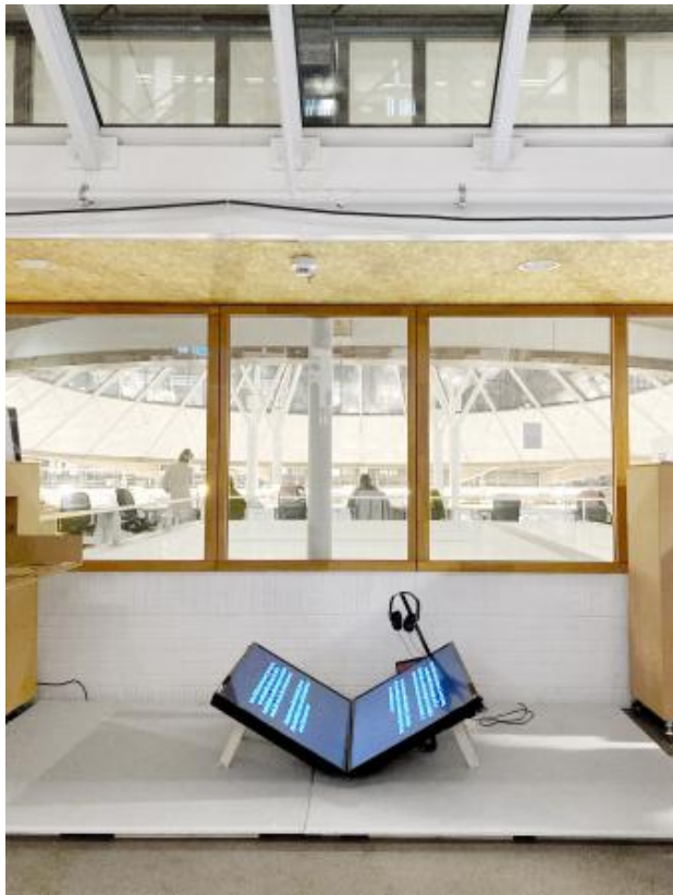
The World We Enter, 2021 2-kanaals video, variable, 9:55 min

Once, back then. Already, 2021 4-kleuren Risodruk, digitale druk, plastic fotoboek, 150 x 100 x 25 mm