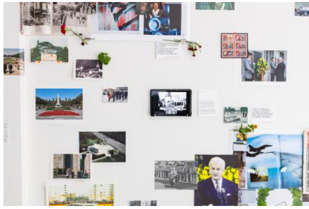
Gestures of Good, 2022

4-kleuren Risodruk, Comcolor druk, digitale druk, tijdschriften, knipsels uit verschillende bronnen, gedroogde bloemen, snijbloemen, strokransen, bladgroen, "Deense" kar voor bloemenhandel, Fc 588, Fc 577 en Fc 566 wateremmers, Moiré-kranslint, franjes, T, variabel