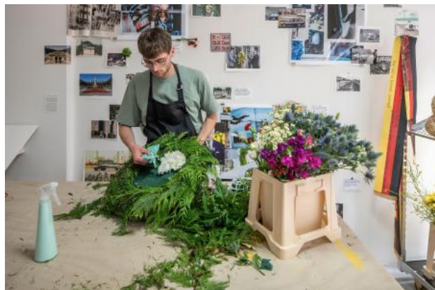
Gestures of Good, 2022 4-kleuren Risodruk, Comcolor druk, digitale druk, tijdschriften, knipsels uit verschillende bronnen, gedroogde bloemen, snijbloemen, strokransen, bladgroen, "Deense" kar voor bloemenhandel, Fc 588, Fc 577 en Fc 566 waterremmers, Moiré-kranslint, franjes, T, variabel