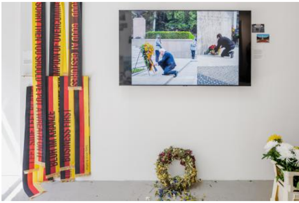
Gestures of Good, 2022

4-kleuren Risodruk, Comcolor druk, digitale druk, tijdschriften, knipsels uit verschillende bronnen, gedroogde bloemen, snijbloemen, strokransen, bladgroen, "Deense" kar voor bloemenhandel, Fc 588, Fc 577 en Fc 566 wateremmers, Moiré-kranslint, franjes, T, variabel