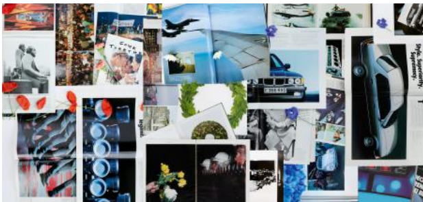
Life in the Post -, 2022

fotocollage, digitale druk, 1782 × 841 mm