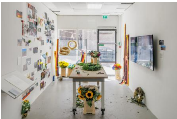
Gestures of Good, 2022 4-kleuren Risodruk, Comcolor druk, digitale druk, tijdschriften, knipsels uit verschillende bronnen, gedroogde bloemen, snijbloemen, strokransen, bladgroen, "Deense" kar voor bloemenhandel, Fc 588, Fc 577 en Fc 566 waterremmers, Moiré-kranslint, franjes, T, variabel