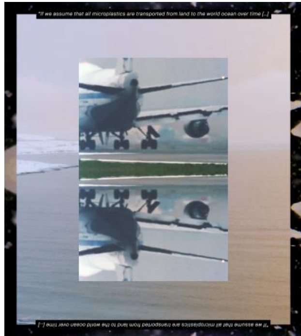
The World We Enter, 2021 2-kanaals video, variable, 9:55 min