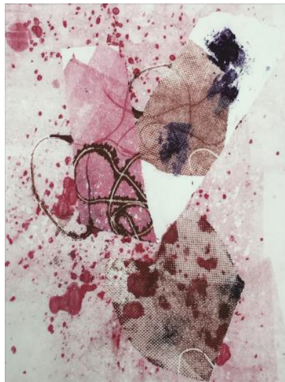
Echoes of Co-existence, 2021 Analogue Objects Print (Mono-prints), 30x40 cm