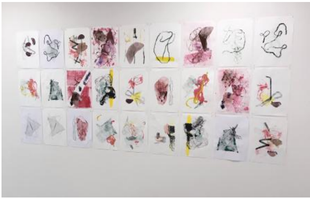
Series Echoes of Co-existence, 2021 Analogue Objects Print (Mono-prints), Ink on rice paper , 30x40 cm each