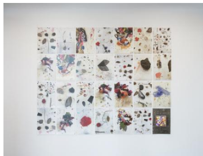
Lost and Found Treasures you give me, 2021 Digital Photography Grid, 29.7 x 42.0 cm each