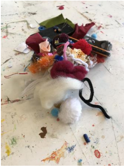
Untitled XVII, 2020 Digital Photography, 29.7 x 42.0 cm