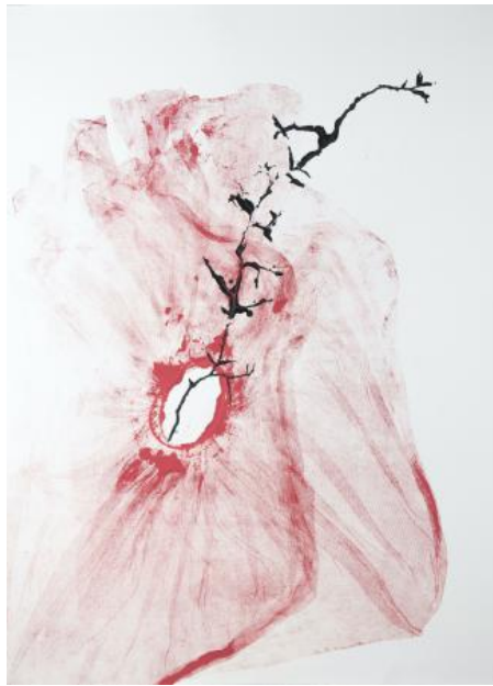
Growing Pains III, 2021 Monoprint, 107x78 cm