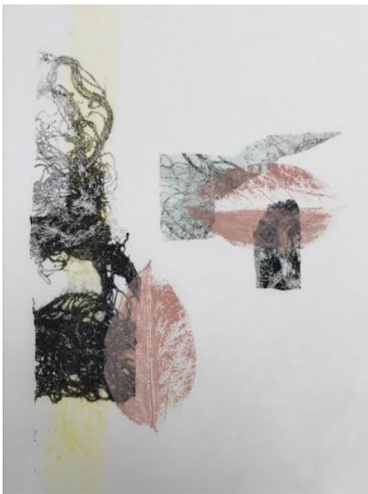
Echoes of Co-existence, 2021 Analogue Objects Print (Mono-prints), 30x40 cm