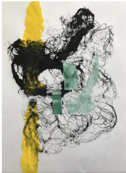
Echoes of Co-existence, 2021 Analogue Objects Print (Mono-prints), 30x40 cm