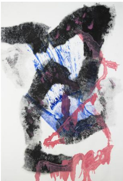
Growing Pains I, 2021 MonoPrint, 112x76 cm