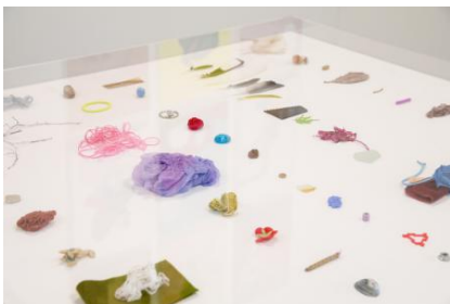
Mother memorabilia - detail, 2021 Found Objects Positioning in vitrine, variable and expandable