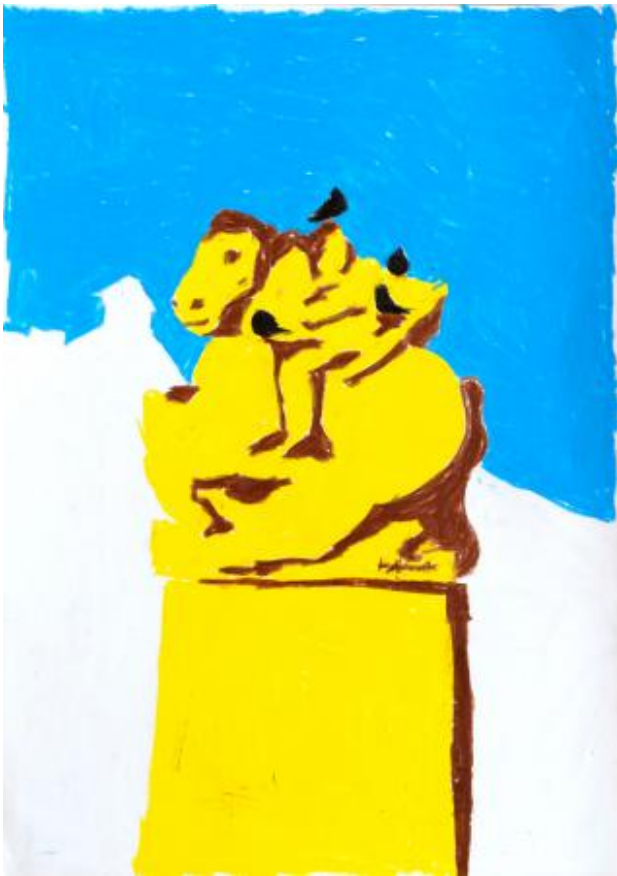
Oh Oh Den Haag, 2024 Wax Crayon on paper, 21 x 29.7 cm