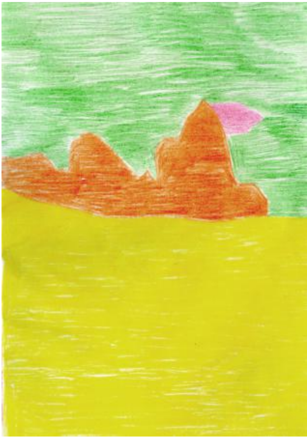
home, 2023 Drawing