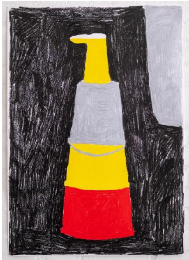
Untitled, 2023 Wax Crayon on Paper, 75x105 cm