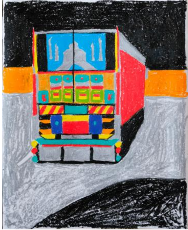
Torno, 2024 Wax Crayon on paper, 56 x 75 cm