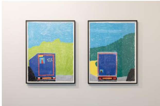
Vormumise Eeldused - Preconditions for Formation at Rüki galerii, 2024 Wax Crayon on Paper