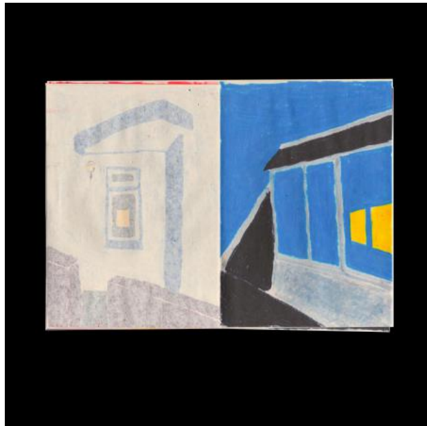
Windows Views, 2023 Publication, A5