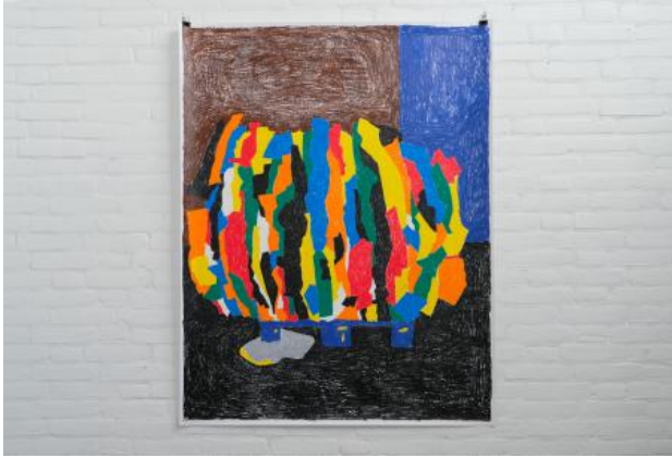
Untitled, 2024 Wax Crayon on paper, 100 x 135 cm