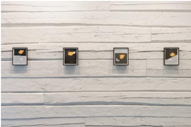
Vormumise Eeldused - Preconditions for Formation at Rüki galerii, 2024 Wax Crayon on Paper