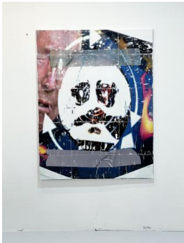
induced compliance , 2024