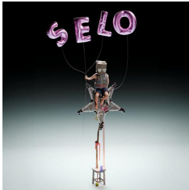
SELO, 2025 Game Engine, Live Simulation