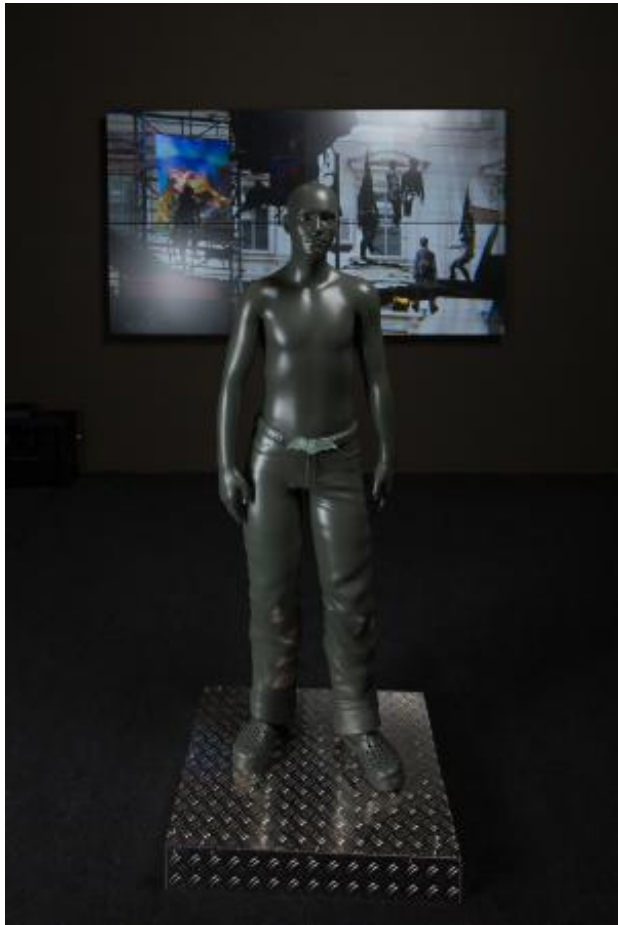
SELO, 2025 Game Engine, Live Simulation