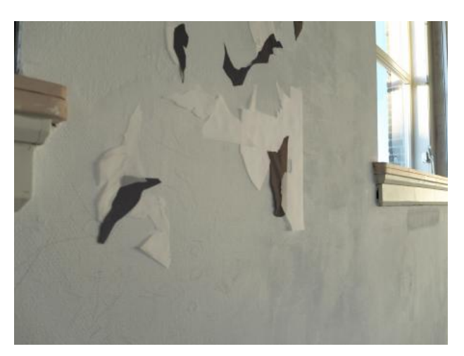
Sojourn, 2022 Paper, light-reflective fabric, pencil on the wall, 220 x 150