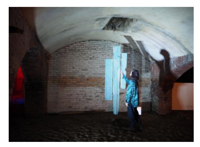
In-Tent-Gible, 2022 textile, video