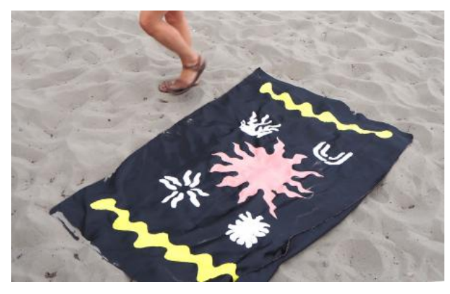
Pinecone, Party, Loss, and Fire , 2022 Textiles, 200 x 120 \,