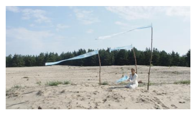
In-tent-gible, 2022 Video, installation, performance