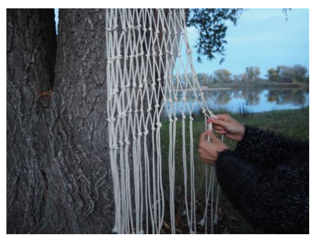
Dreams of the River, day 2, 2022 Performance, textiles knotting