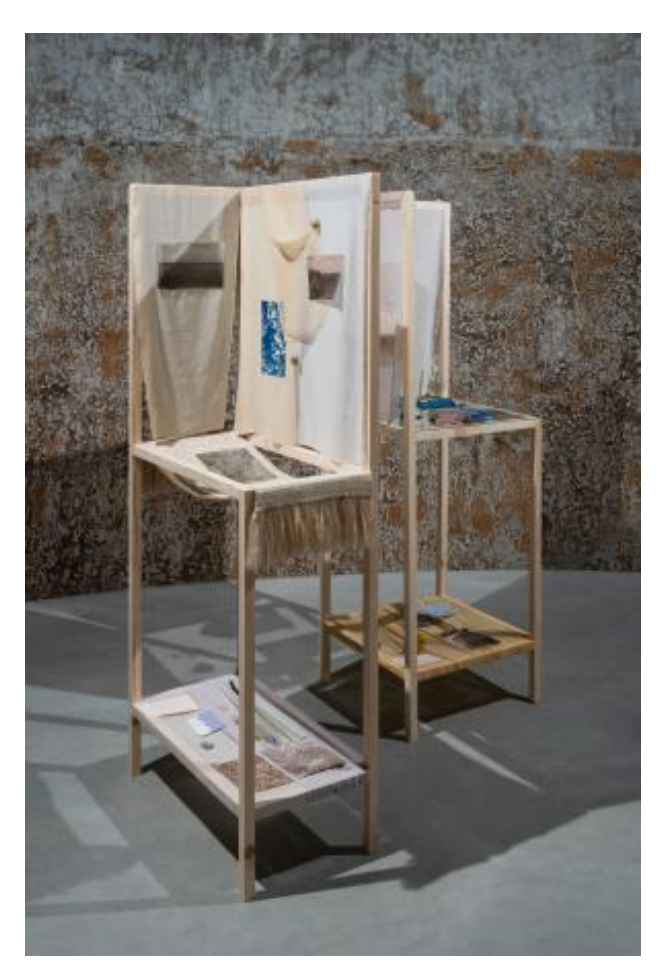
Cattails and Paper Mountains, 2023 textile, photography, installation , various dimensions