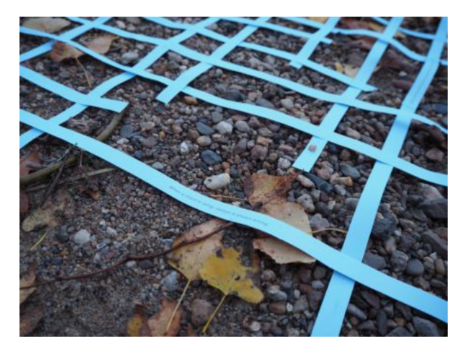
Dreams of the River, day 1, 2022 Text, paper, temporary installation