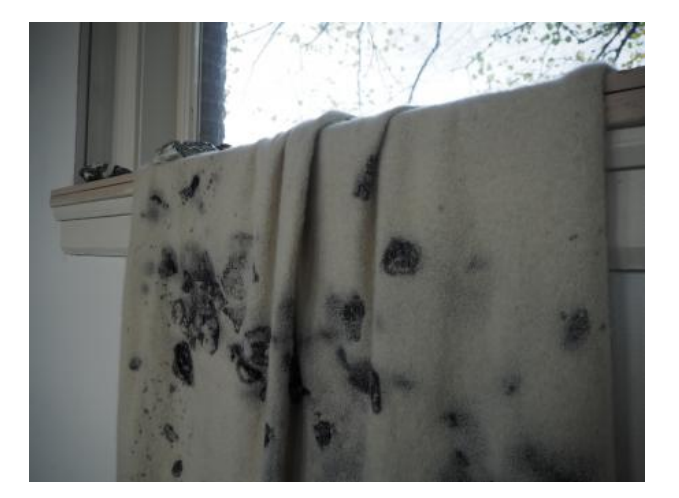
Forgotten Artworks, 2023 jacquard weaving