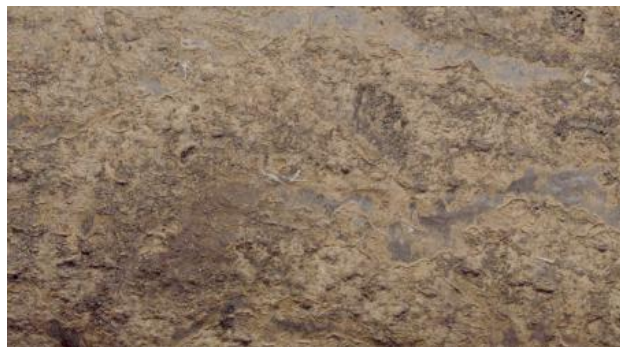
From the Ashes, 2023