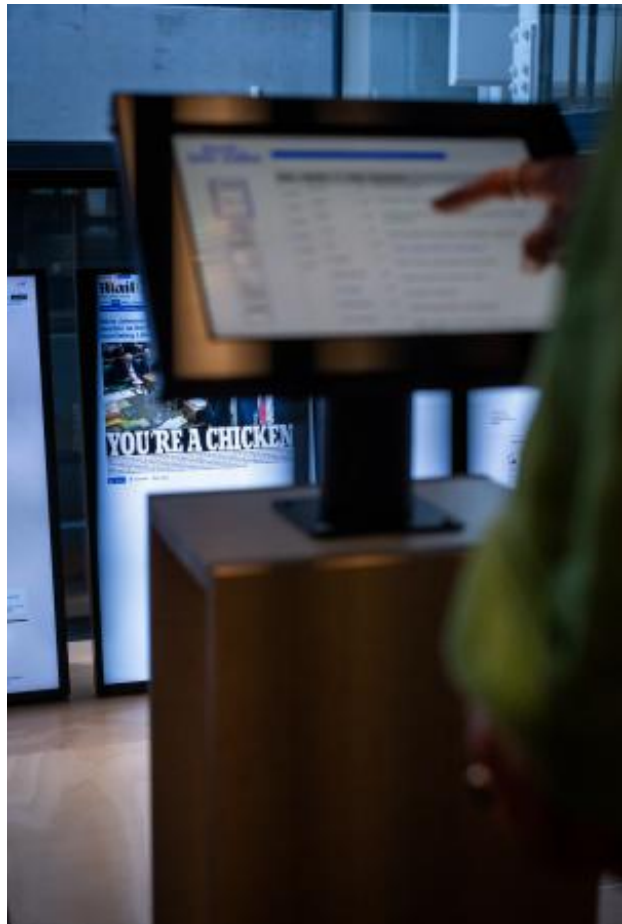
Brexit News Archive, 2022