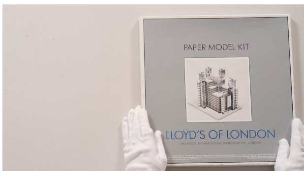
Thy Cities Shall With Commerce Shine--Part I, 2021