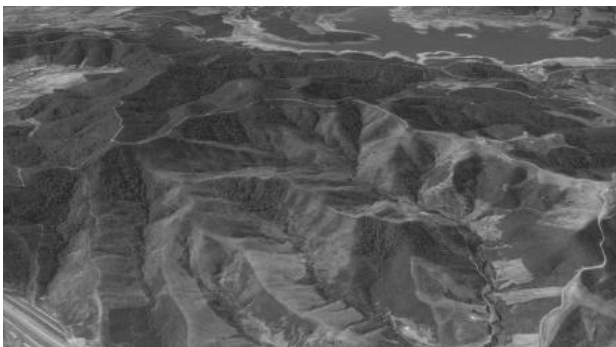
From the Ashes, 2023