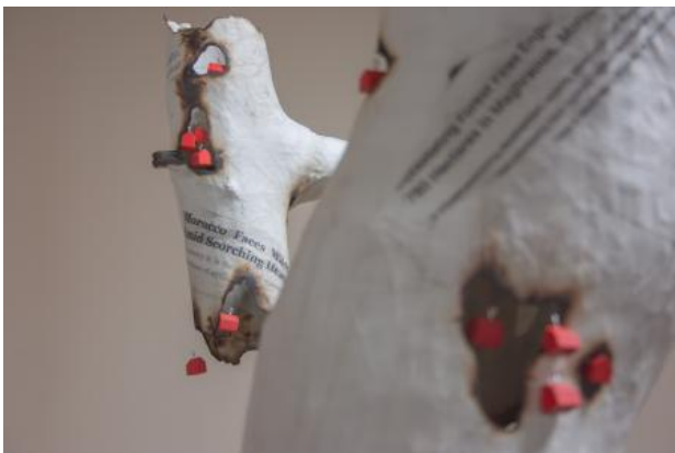
From the Ashes, 2023