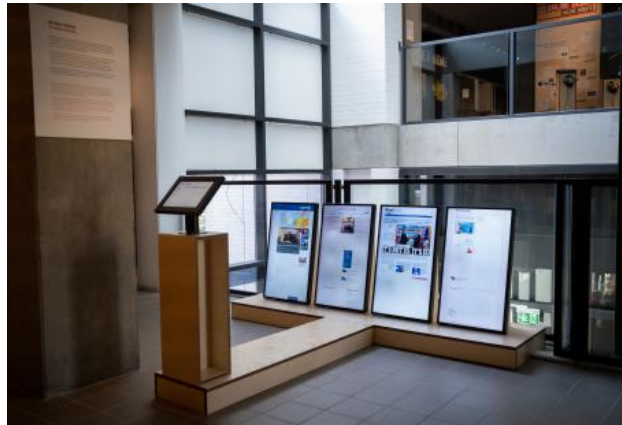
Brexit News Archive, 2021