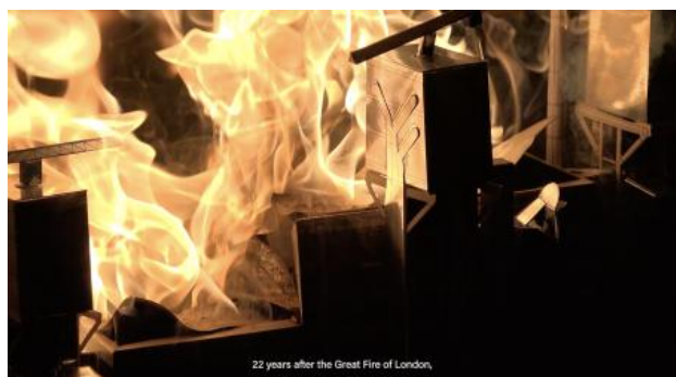
Thy Cities Shall With Commerce Shine - Part I, 2021