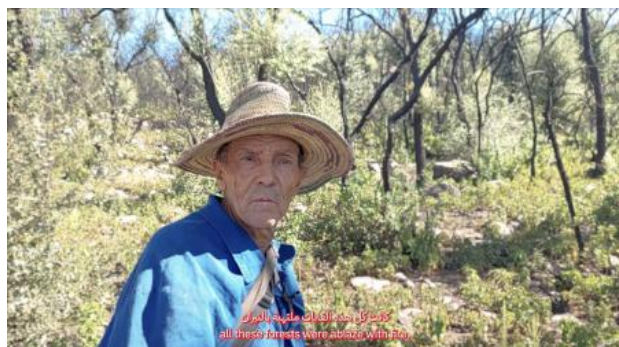
From the Ashes, 2023