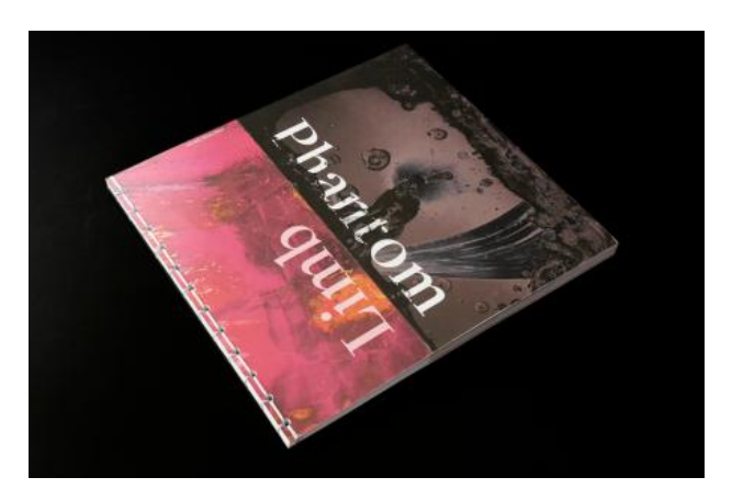
PHATOMPAIN, 2022 CMYK printing