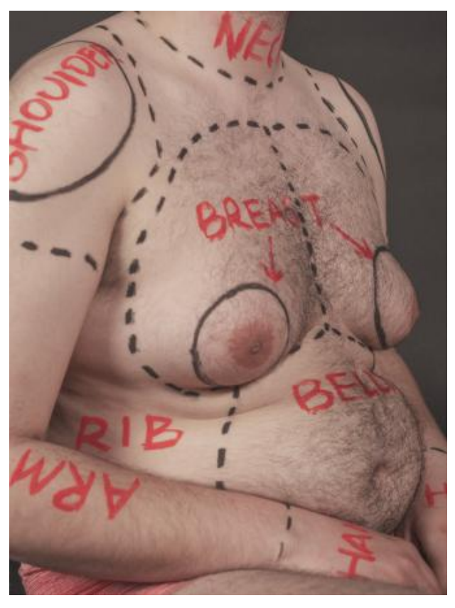
Nice Meating You, 2022 Giclee print, 75 x100cm