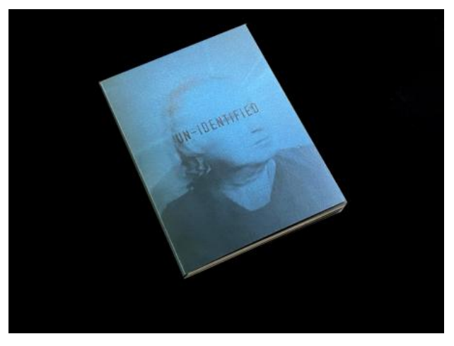
UN-IDENTIFIED, 2022 CMYK printing