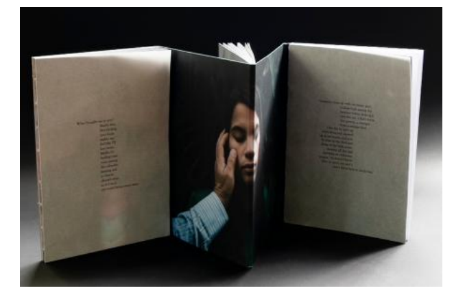
ABSENCE, 2022 CMYK printing