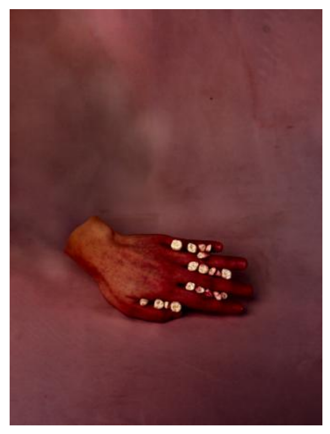
Nice Meating You, 2022 Giclee print, 75 x100cm