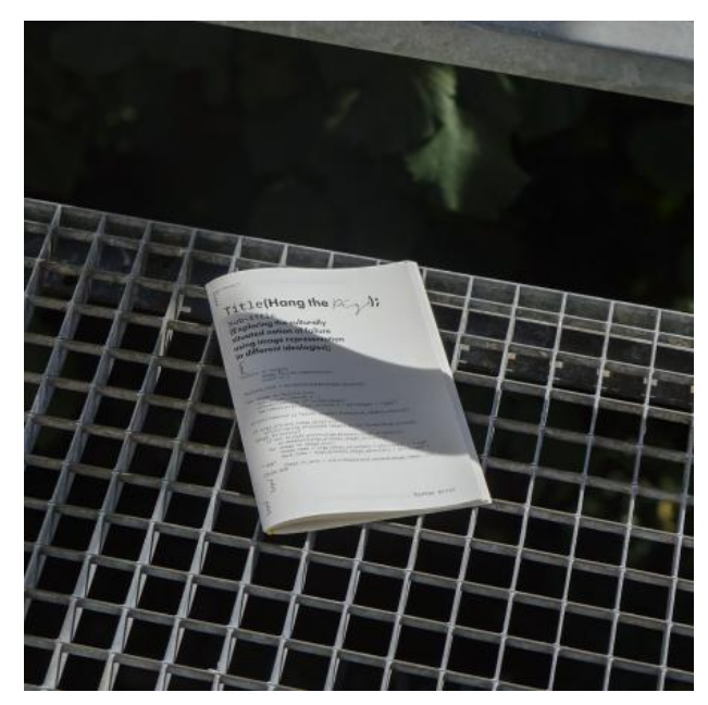
Hang the Pig, 2022 Greyscale, Size: 210 x 150mm ; 60 pages, 13,500 words