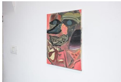
, 2022 oil on canvas, 40 X 30 cm