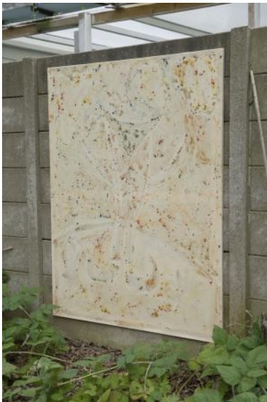
"Ode to the cliff", 2021 "Harlequin Droppings", latex