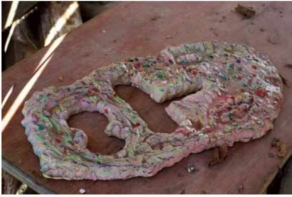
"Mask", 2020 Plaster, confetti, wax crayon, epoxy