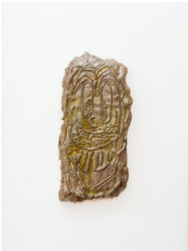
, 2023 plaster cast, epoxy, pigments

www.ofluxo.net/stendhal-syndrome-christian-roncea-at-gipsenzaal-kabk-the-hague-nl/