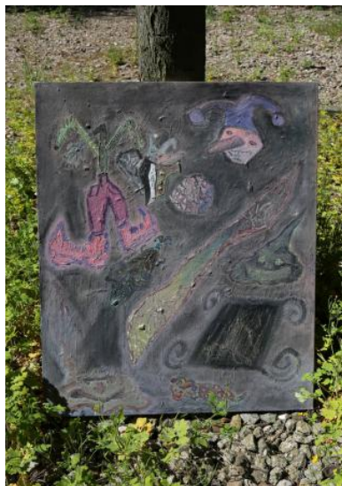
"Four Flies On Grey Velvet", 2020 oil on canvas, 79,5 X 99,5 cm