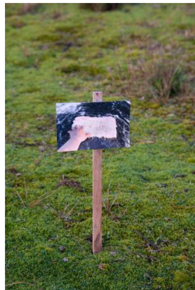
"Atlantis", 2020 EPISODE 2: "Dunes", Off-Site Project by Dharma Initiatives, The Hague