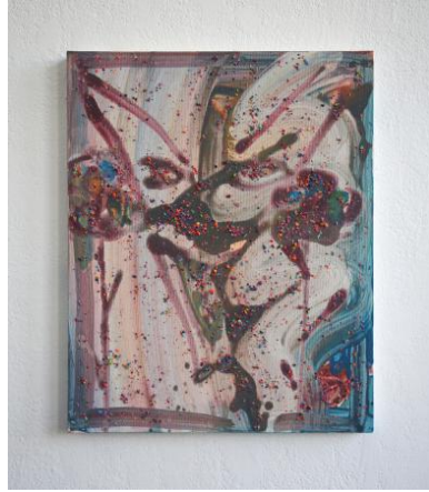
"The fox(follow-up email)", 2021 Harlequin Droppings, acrylic on canvas, 40 X 50 cm