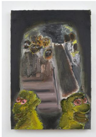
"Guardians (universitate)", 2023 oil on linen