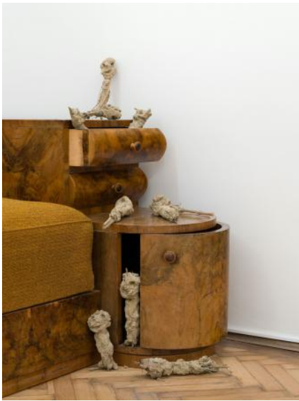
, 2023 self-made earthenware, cherry plums tree sticks, varied dimensions