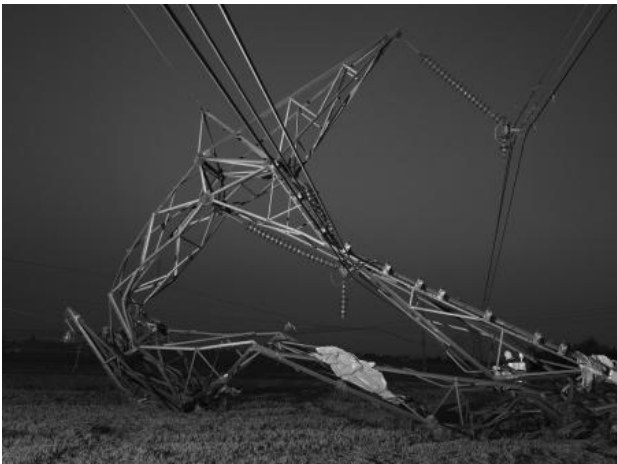
Fault Line, 2023