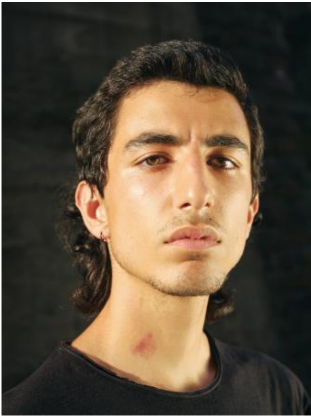
Fault Line, 2023