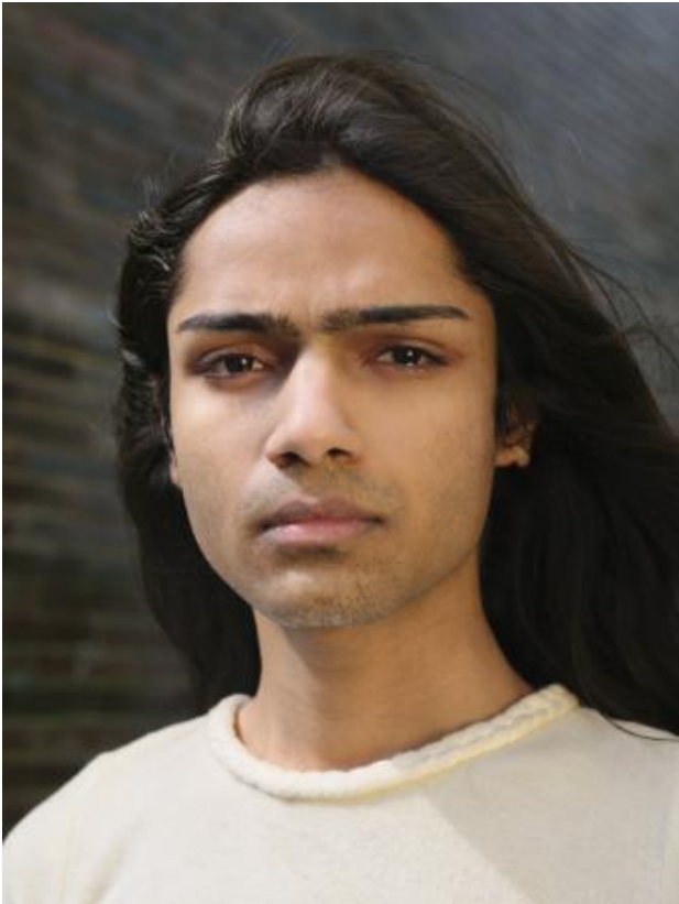
Fault Line, 2023