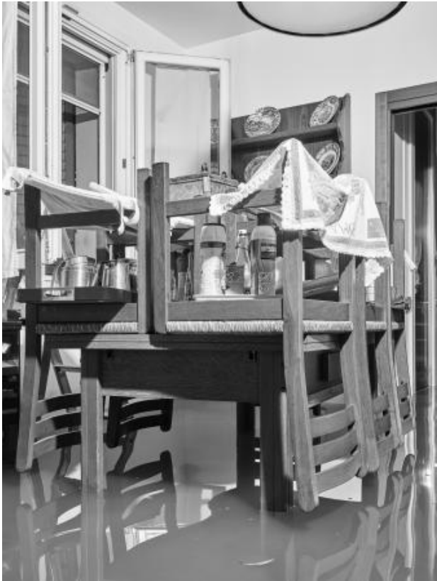
Fault Line, 2023