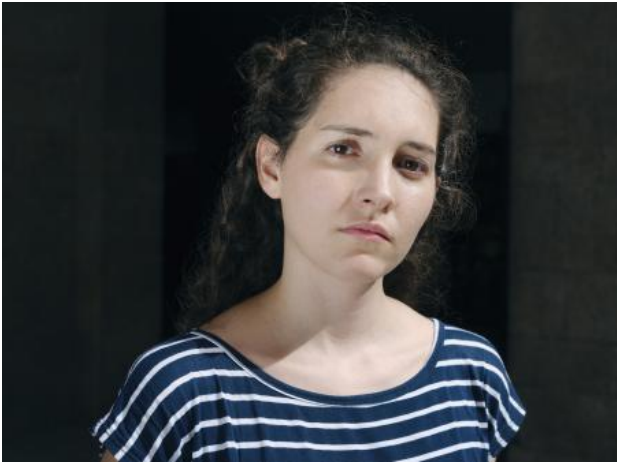
Fault Line, 2023