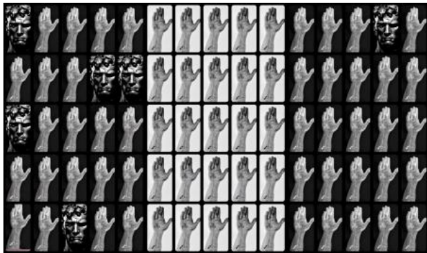
Bereitschaft, 2024 3 channel video