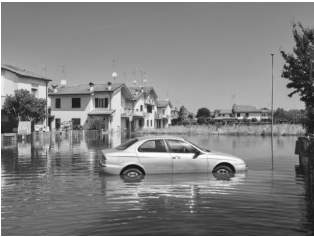
Fault Line, 2023