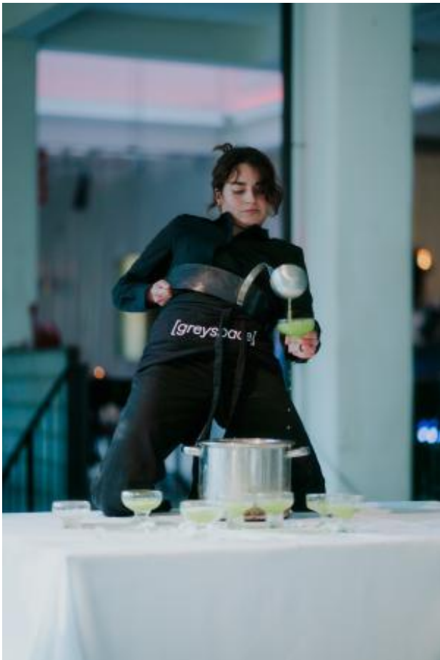
[dis]comfort food, 2023 Dinner Performance

in MTF Stockholm. As the population of cities grow, the pressure on and crowding of infrastructure grows. Public spaces become stressful sites of sensory overload. We want to identify the the stressful factors of a given environment and offer relief, a moment of redirecting the mind and calming the body with sound. We have created two use cases, each complementing the other.