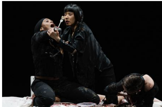
Elbows on the table, 2022 Performance