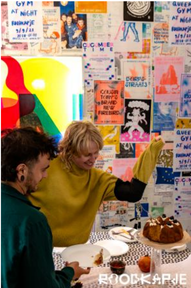
[dis]comfort food Cake Ceremony , 2023 Installation - Performance