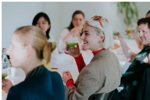
[dis]comfort food, 2023 Dinner Performance