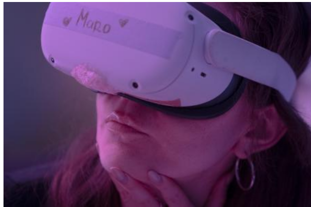
Metaphysical Tasting, 2023 Dinner performance