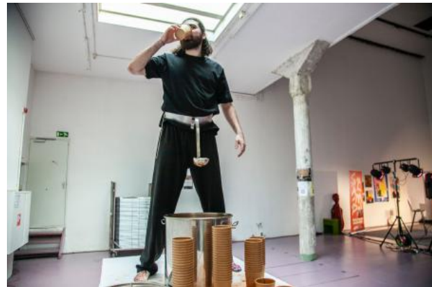
Belly, 2022 Performance/Catering