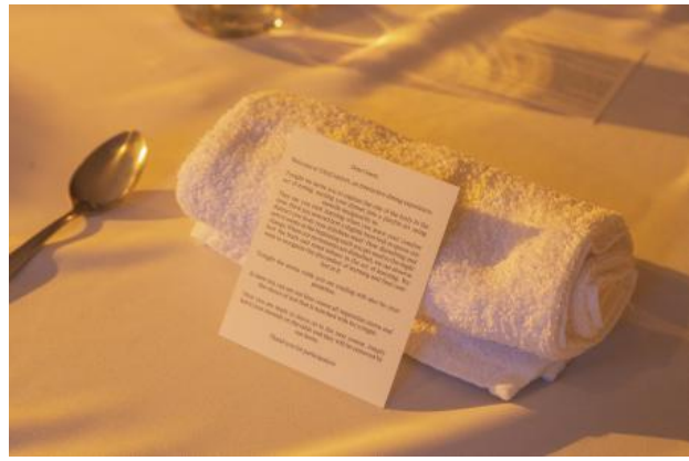
[dis]comfort food, 2023 Dinner performance