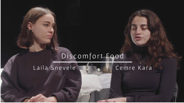
[Dis]Comfort Food, 2021 2:21