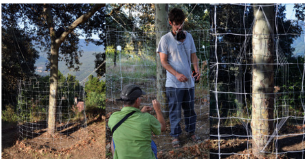
Strings & Needles, 2019 Two contacts mics, one H4N zoom field recorder, an amplifier, a found metal fence, fishnet wire, a bunch of needles, 1.5m x 3m