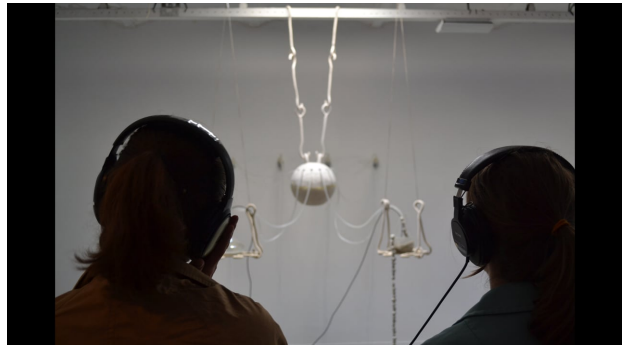
De(c)lay - (HEADPHONES ON), 2019 4:07