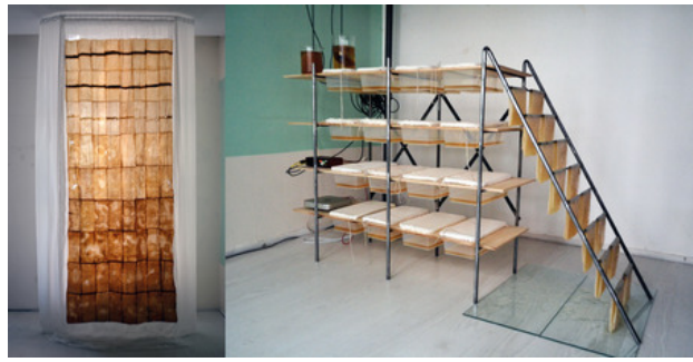
The Pages of my Research, 2020 Sound Installation // Metal, white textile, dried (microbial) cellulose, four tactile transducers, wood, microphone (karaoke) amplifier // 1.21m x 97 cm x 38cm Textile Installation // Metal, white textile, dried (microbial) cellulose, LED lights // 3, 1.21m x 97 cm x 38cm & 3m x 1.5m x 30 cm