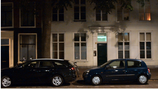
The Pages of My Research - 'Paviljoensgracht' (HEADPHONES), 2020 3:29