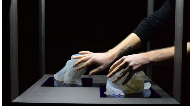
APP(E)AL(L)ING, 2018 2:09