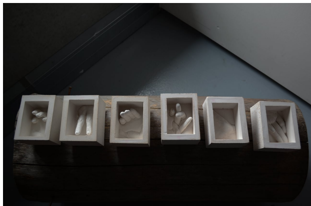
Hands, Fingers and their Signs, 2017 00:07