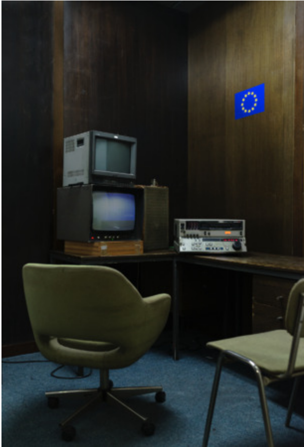
Believe it Or Not Photography