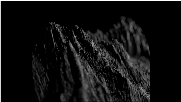
V8-masked, 2018 4.57