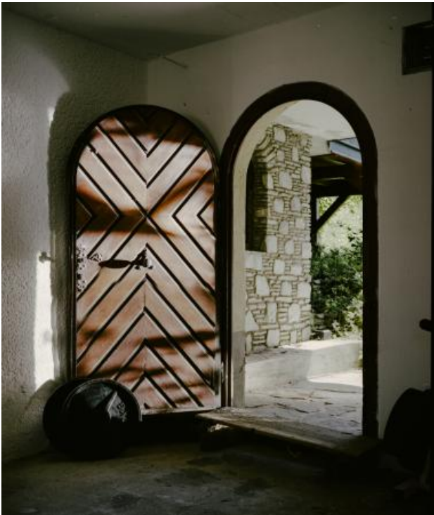
Flex Kurz, 2022