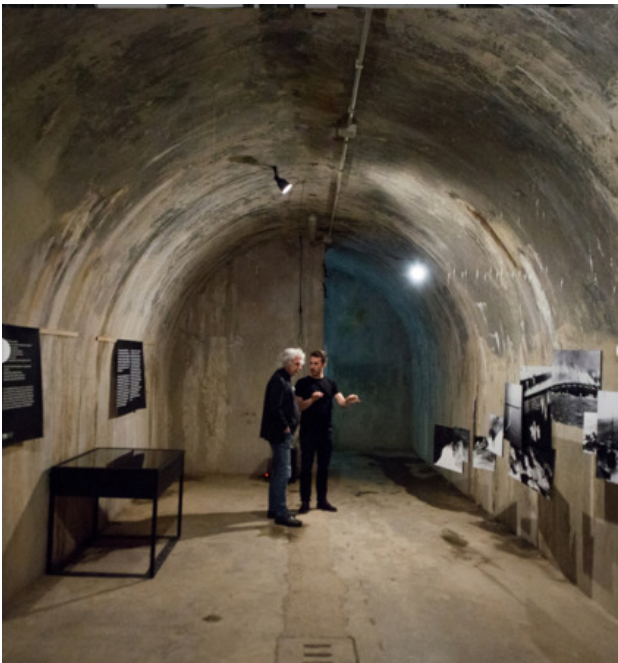
Vista Fronte Mare photography