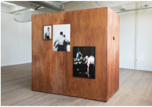
Flex Kurx, 2018 Photography, wood.