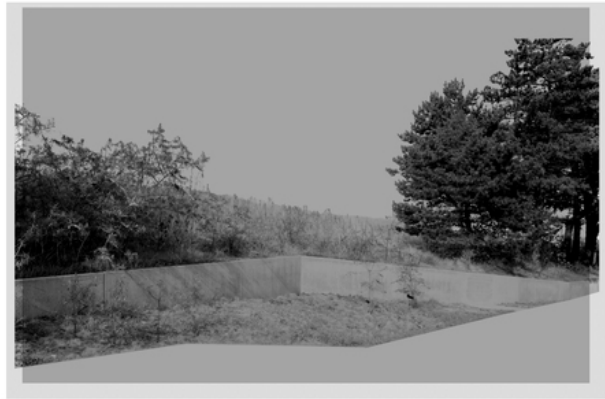
52°06'21.9" N 4°19'08.6"E, 2018 Collage