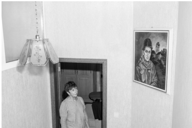
untitled, 2019 Digital photography