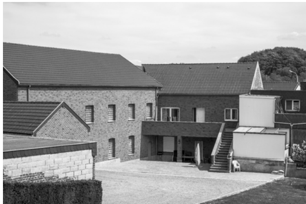
untitled, 2019 Digital photography