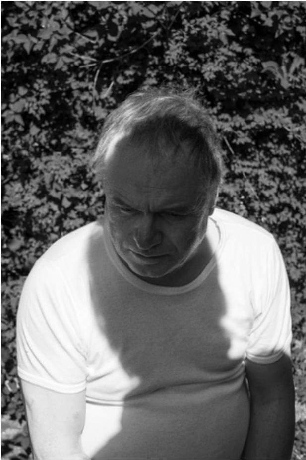
untitled, 2019 Digital photography