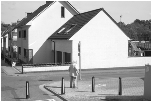
untitled, 2019 Digital photography