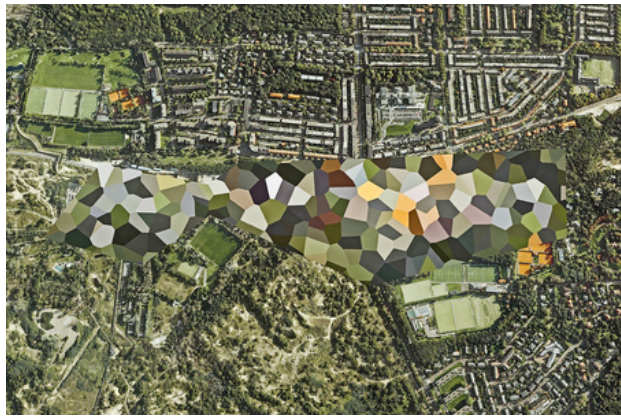
Censorship, 2019 Image appropriation