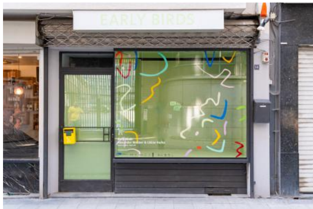
Early Birds, 2023