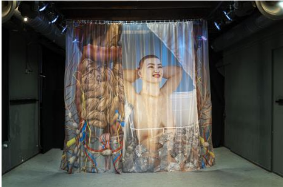
Ice Bath, 2021 Digital print on polyester, 535 x 350 cm