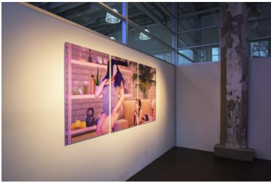
Super Confident, 2021 Uv print on acrylic, 240 x 100 cm, triptych