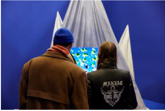
You are light and cabbage, 2023 video sculpture, 300 cm x 250 cm x 250 cm