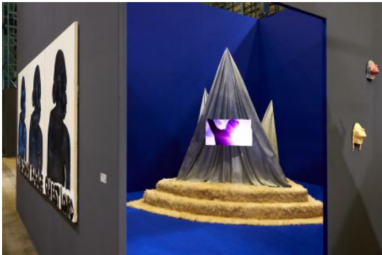
You are light and cabbage, 2023 video sculpture, 300 cm x 250 cm x 250 cm