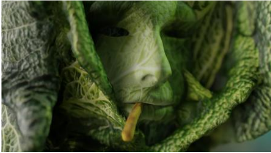
You are light and cabbage, 2023 video still