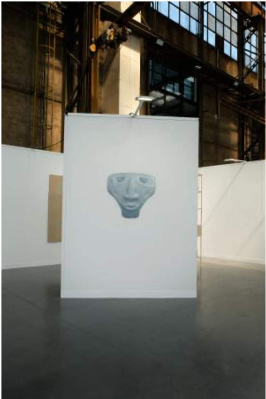
Lucky charm to remove all your trauma, 2023 digital print, Various sizes