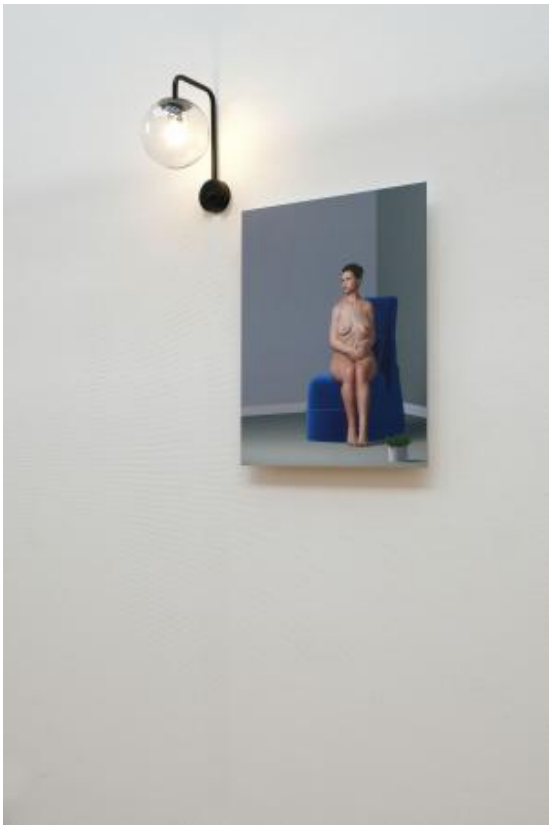
Untired, 2021 UV print on aluminium, lamp, 60 x 75 cm