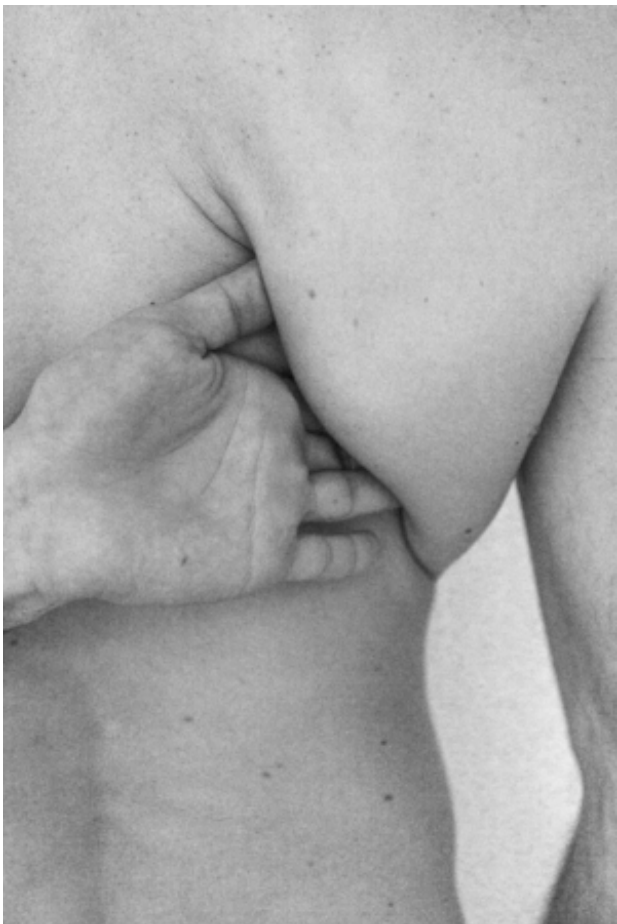
Under the Scapula, 2019 Pigment print mounted on dibond, 73 x 110 cm