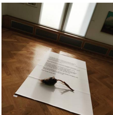
Installation BRUJA at Spring Saloon, 2021 Writing and sculpture., 20cm x 150cm x 200 xmm