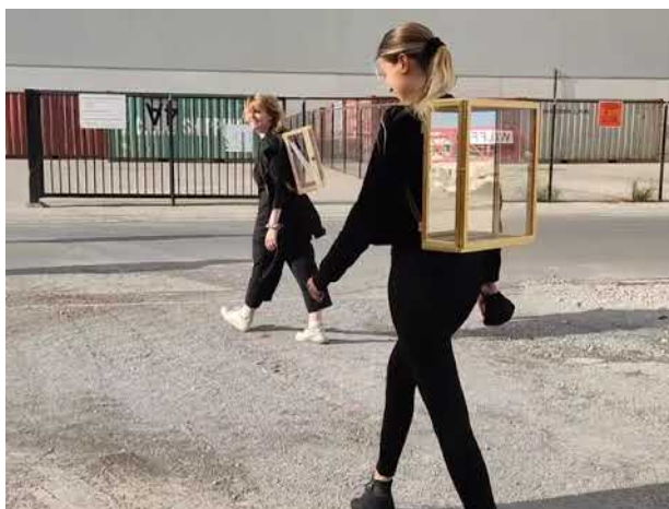
KONVOOI FESTIVAL - BRUGGE BELGIUM, 2021

SOLO EXHIBITION CONTRARY TO WHAT WE THOUGHT SO FAR. PULCHRI STUDIO, THE HAGUE., 2022 Installation., Various.