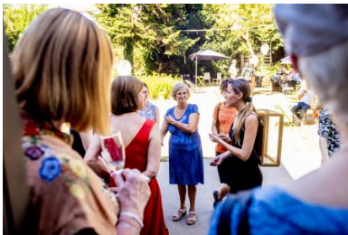
GROUP EXHIBITION PLUSSING. WARP, CONTEMPORARY ART SPACE. Sint Niklaas, Belgium. August/September 2022. . 2022 Sculpture/Performance, Variable.