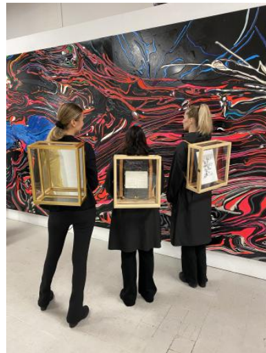
PERFORMANCE IN THE FRAME OF HOOGTIJ DEN HAAG., 2022 Performance., Variable.