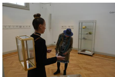
Amethyst - Pulchri Studio, 2021 Various., Variable