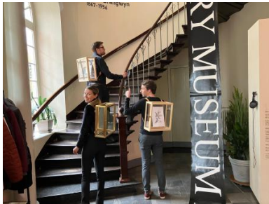
EXHIBITION BENCH-MARK April 2023. Arentshuis Museum. Bruges, Belgium., 2023 Various., Various.