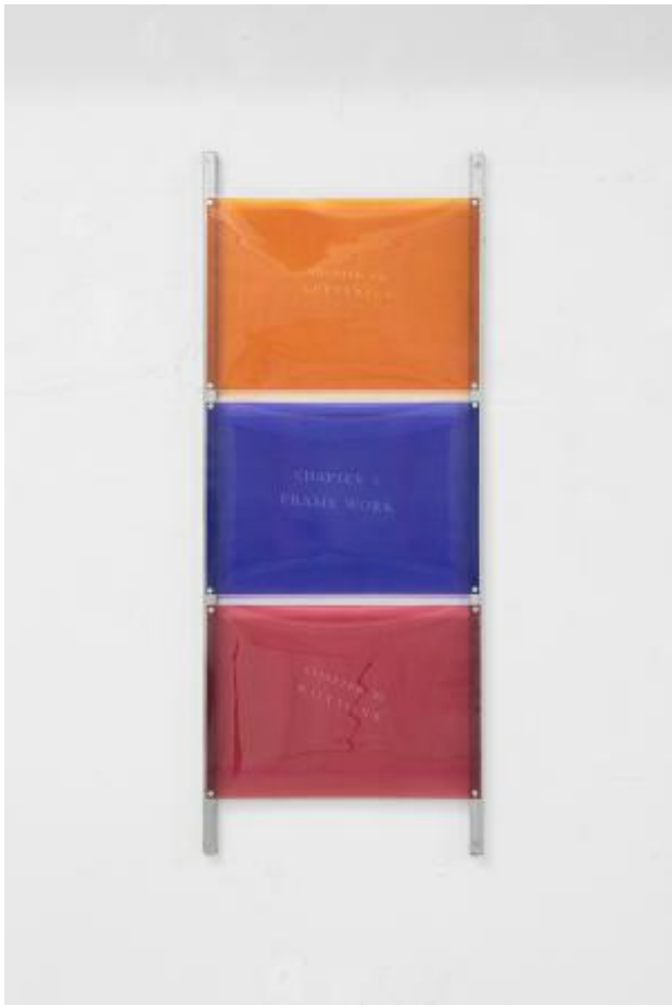
Single Framing: Second by Second, 2024 Scratched away laser printing on acetate, steel beam, magnets.