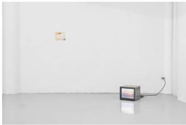
Single Framing: Second by Second, 2024 UV printing onto acrylic; TV, audio piece., Variable dimensions