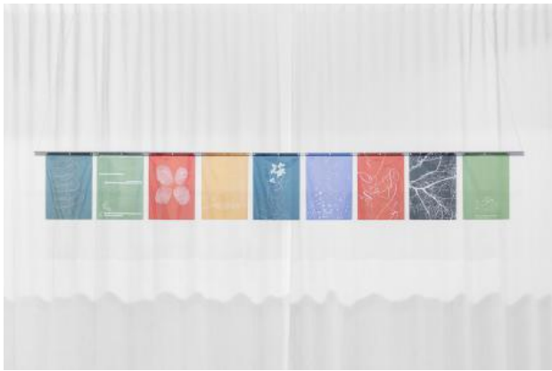
Single Framing: Second by Second, 2024 Scratched away laser printing on acetate, steel beam, magnets., 42 x 29.7cm.