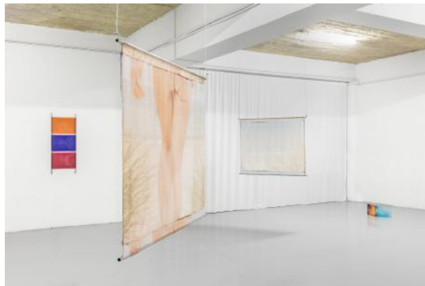
Single Framing: Second by Second, 2024 Double-sided sublimation printing onto transparent fabric, steel beams. UV printing onto acrylic, hinges, bolts. Scratched away laser printing onto acetate film, steel beams, magnets., Variable dimensions