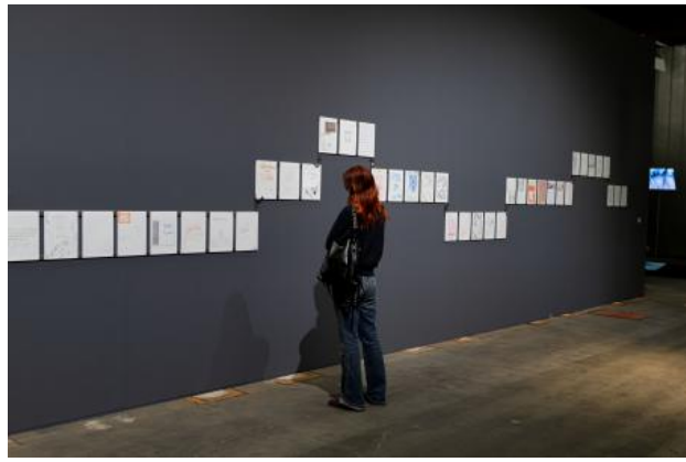
Little Odes, 2024 Graphite and coloured pencil on transparent paper, mild steel beams, custom aluminium magnets., 210 x 297 mm each