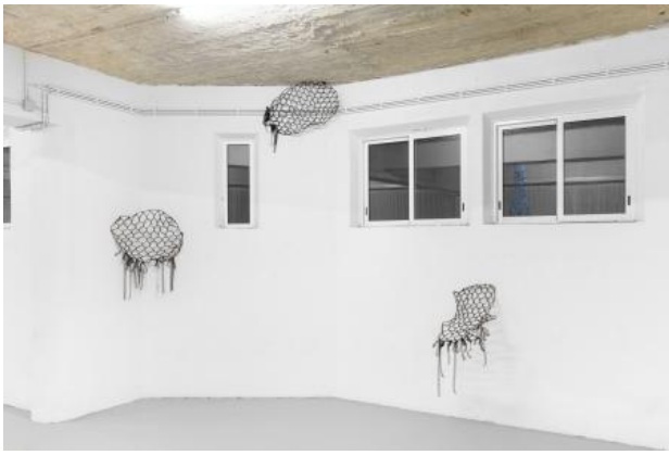
Single Framing: Second by Second, 2024 Knotted ribbon, copper, Variable dimensions