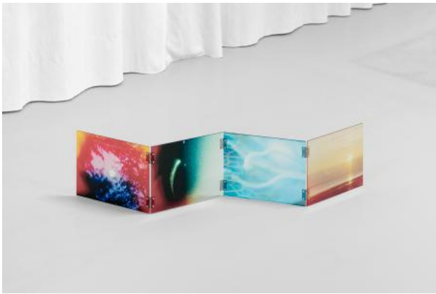
Single Framing: Second by Second, 2024 UV printing onto acrylic, hinges, bolts., Variable dimensions