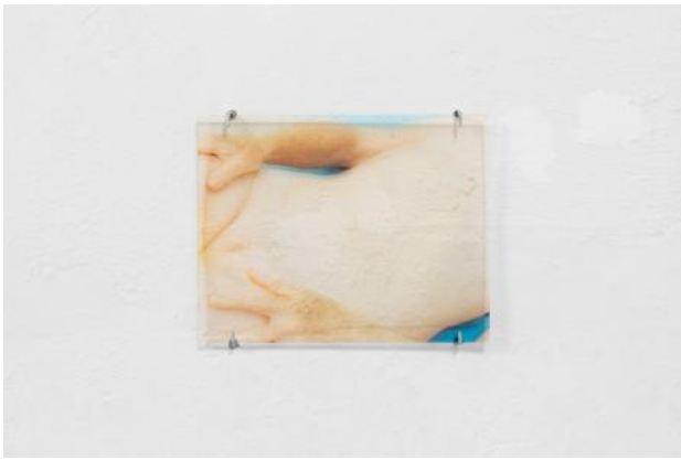
Single Framing: Second by Second, 2024 UV printing onto acrylic