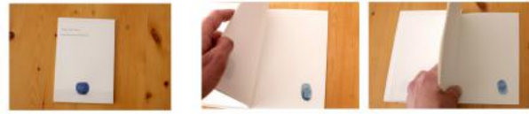
Adam and Eve (Corroborating Evidence), 2021 Artist Book, 18.5cm x 13cm, 32 pages