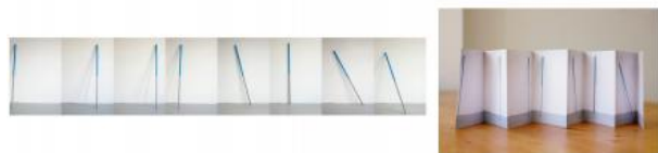
Restless, 2019 Leporello book (folded), Leporello book (folded) 20cm x 13cm, 7 images