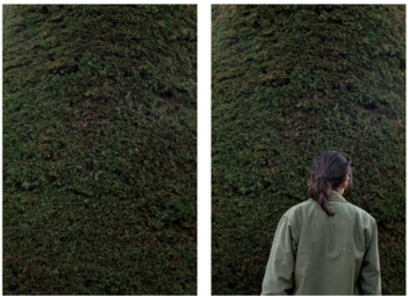
Untitled, 2016 Digital C print, 40x60