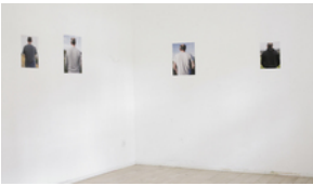
A Walk, 2016 Digital C-print, variable