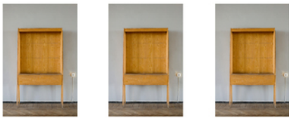
where is everybody, 2018 Digital C-Print, 70x45cm