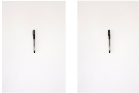
Black and Red, 2018 digital c print, 60x40