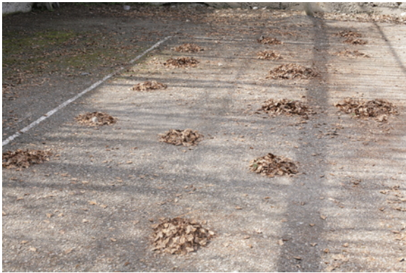
practising landscape, 2018 digital c print, 54x36