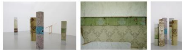
Hotel Iveria, 2020 Inkjet Prints, dimensions variable 100x177