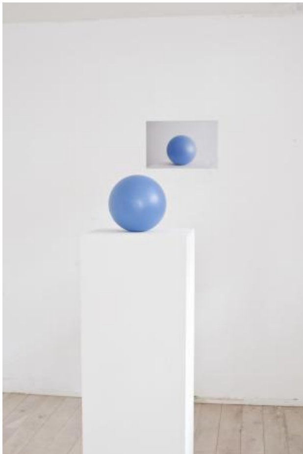
Untitled, 2020 Lambda Print, resin, a stand, 40x60cm