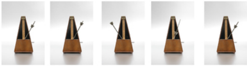
green ray, 2017, lambda prints, composed of 5-7 images, 74x54 cm