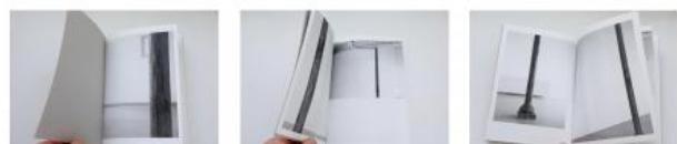
Doors Imperceptibly Ajar, 2024 Five Photographic Digital Prints, 29x21cm