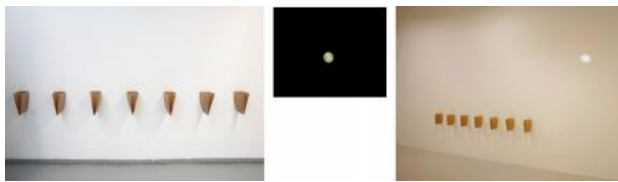
A drop, 2021 Paper, video projection, 24x16cm