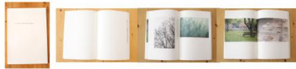
On a Clear Day Nothing Ever Happens, 2020 Artist Book, 21x30cm, 52 pages