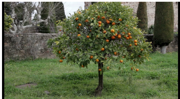
mandarin tree, 2017 30 sec video loop