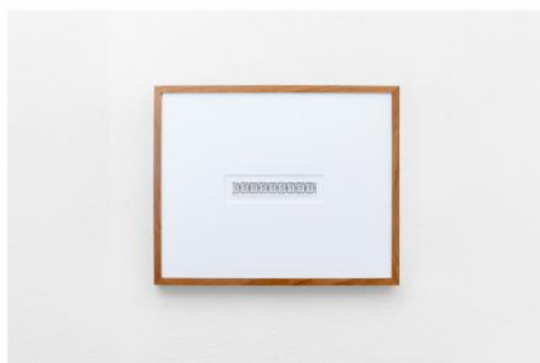
Last Five!, 2024 wooden frame, museum glass, illustration, 30 x 24 cm