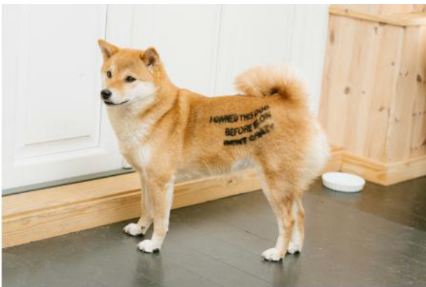
I OWNED THIS DOG BEFORE ELON WENT CRAZY, 2025, images, natural paint on shiba

Jungle TV, 2025 mix-media installation, film, sculptures, lightboxes, found material, and object