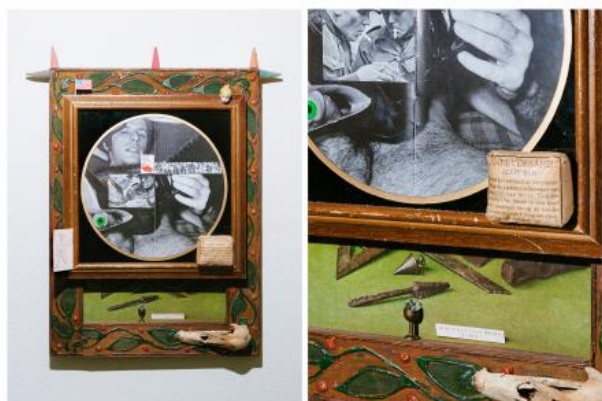
Dirty Days , assemblage with images and found objects, duck skull, incense, brass, glass, bandage kit, double wooden frame, 36 x 42 x 5 cm, 2024