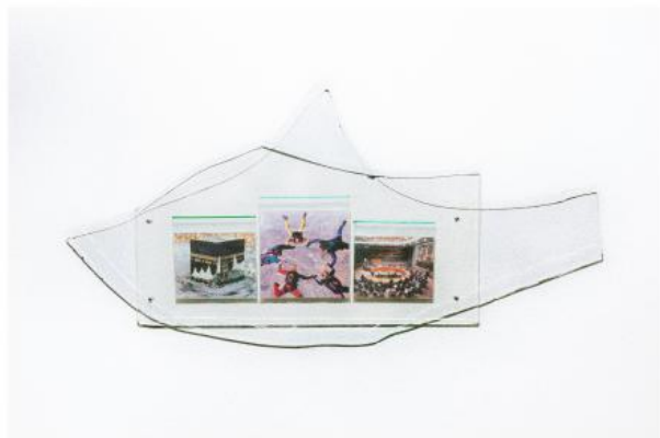
I OWNED THIS DOG BEFORE ELON WENT CRAZY, 2025, 20 x 10 x 10 cm, glass, nut and bolt, weedbags, found images

I OWNED THIS DOG BEFORE ELON WENT CRAZY, 2025 research, mix-media installation, video, tape, images, text, wood, plastic, and banana