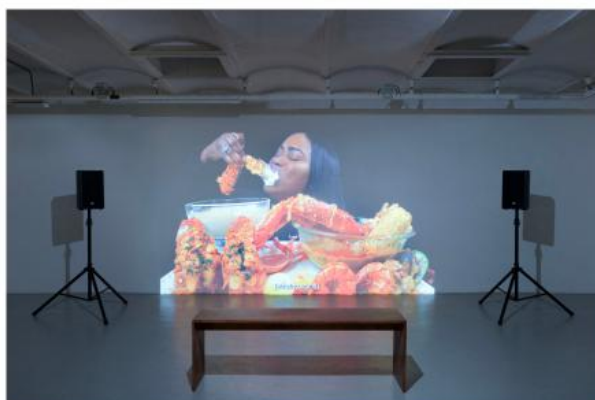
I Am Lobster , screening installation, 16:29' minutes, HD, single-channel video, Quai, The Hague, 2023 In collaboration with Fused Playbook and The Lobster Lobby