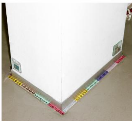
Exhibition view at 'Highland' Heden, The Hague