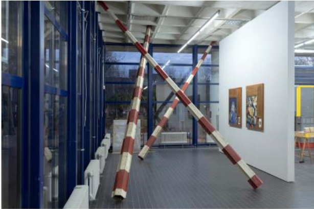
Around Europe, 2025, mix-media installation, photography, archive images, and bar gates

2016 - Chair Participatory Council at the Royal 2018 Academy of Art, The Hague