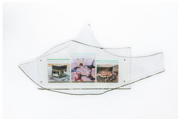
1002 Grams, 2024 glass, nut and bolt, weedbags, found images, 55 x 28