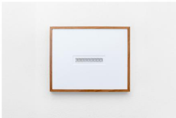
Last Five!, 2024, 24 x 24 cm, wooden frame, museum glass, illustration, exhibition "Nightshift", Heden, The Hague

5475 Grams, 2024 mix-media installation, loop, 17:45', SD, video, smoke, wooden frame with illustration, glass frames with found images, weedbags, glass, and smoking papers