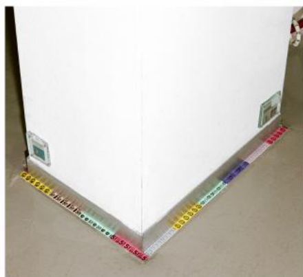
Exhibition view at "Nightshift", Heden, The Hague

1002 Grams, 2024 glass, nut and bolt, weedbags, found images, 55 x 28