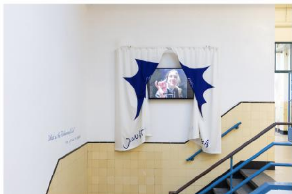
Is This What I Want? video essay, 7:32' minutes, HD, mixed media installation, 2018