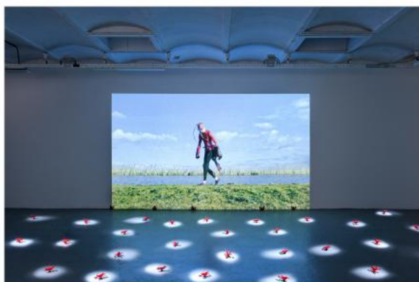
I Am Lobster , video installation, 16:29' minutes, HD, single-channel video, Quai, The Hague, 2023 In collaboration with Fused Playbook and The Lobster Lobby