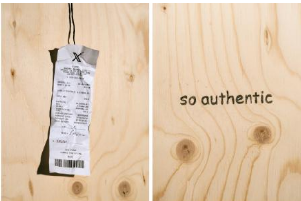
Presentation view at "Open Studio", FRANKS, Oslo

I OWNED THIS DOG BEFORE ELON WENT CRAZY, 2025 research, mix-media installation, video, tape, images, text, wood, plastic, and banana