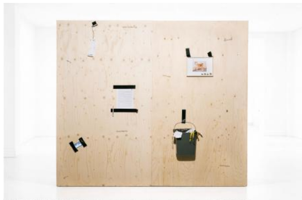
I OWNED THIS DOG BEFORE ELON WENT CRAZY, 2025, research, mix-media installation, video, tape, images, text, wood, plastic, and banana, artist "Open Studio", FRANKS, Oslo

I OWNED THIS DOG BEFORE ELON WENT CRAZY, 2025