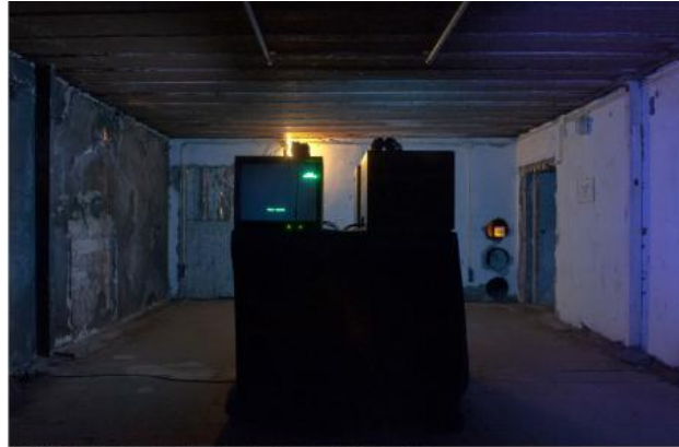
Jungle TV, 2025, mix-media installation, film, sculptures, lightboxes, found material, and object

Around Europe, 2025 mix-media installation, photography, archive images, and bar gates