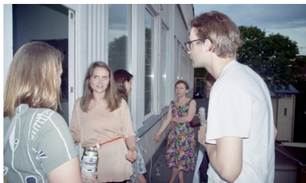
'apparently we talk too little about it', 2019 performative participatory acts, 1 - 10 mins