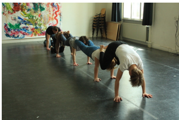
workshop purposeless, 2018 performative workshop