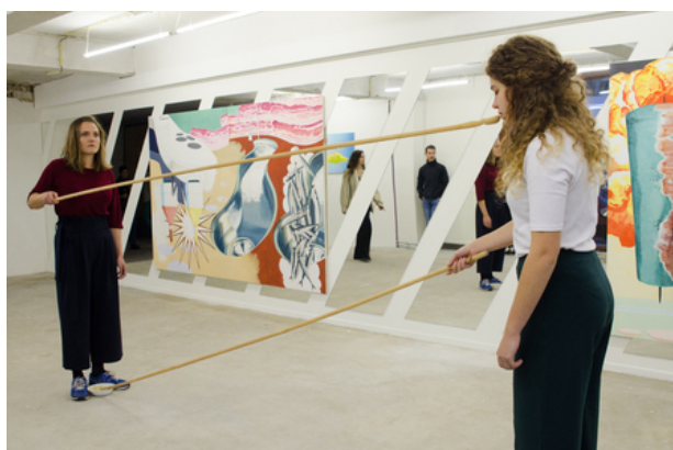
'untitled', 2018 performance, 2 x 3m