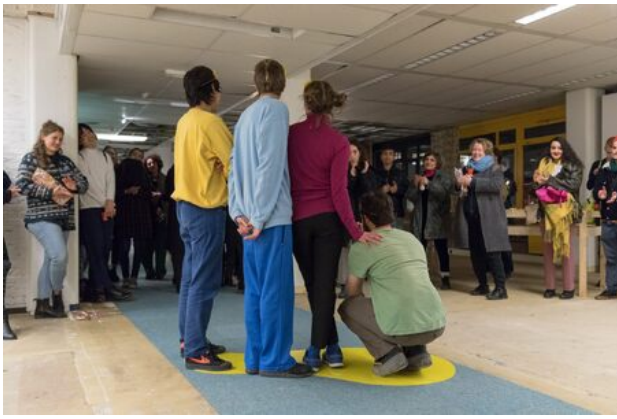
slušaj mali (listen you little one), 2017 performance