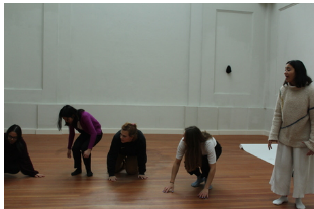
'Say something on judgement, Say it in Action, Let's be adults about it', 2019 performative workshop, 4 days of 5 hours with a group of 9 people in total