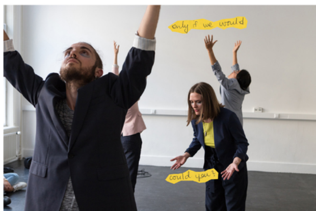
zblojeni shojeni (confused trampled), 2018 performance