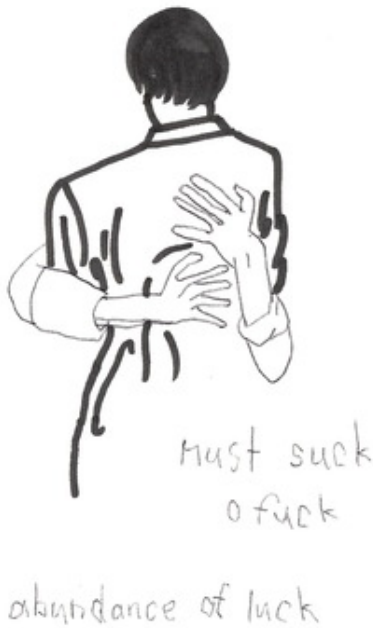
must suck, 2019 felt marker on paper, A5

-- -- -- managing and leading a workshop Loopt nog