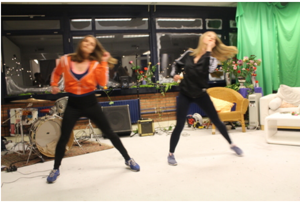
precise exercise, 2017 performance