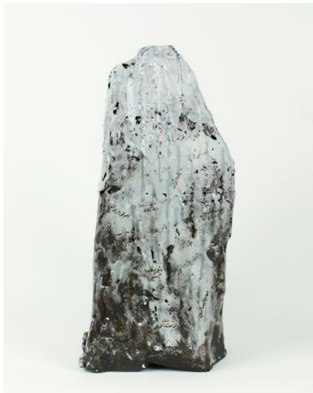
My Alborz, 2023 steengoed keramiek, 20x20x43