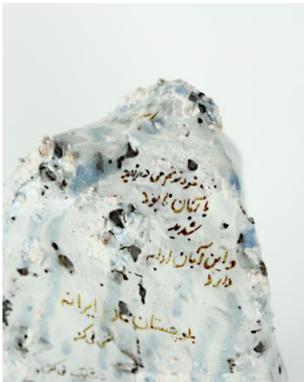
My Alborz, 2023 Steengoed Keramiek, 20x20x43

2010 - design and produce handy crafts and 2014 bags