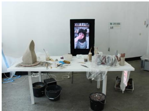
Documentation of a Possible Artwork, 'Iran', 2023 mixed media, videos, 2mx180cmx150cm