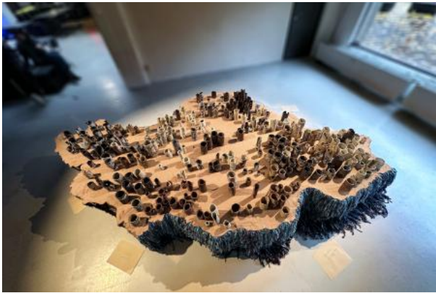
Echoes of the Past, 2023 Textile, ceramic, soundscape, 420x210x50cm