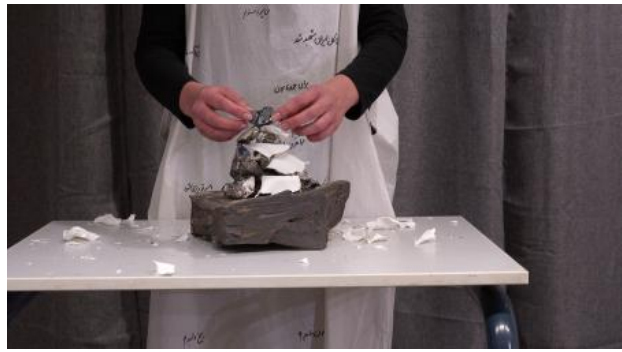
Democracy, 2023 Performance, Keramiek