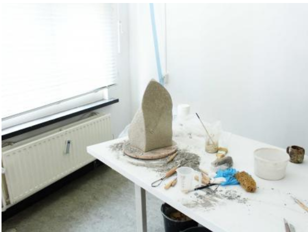
Documentation of a Possible Artwork, 'Iran', 2023 mixed media, videos, 2mx180cmx150cm