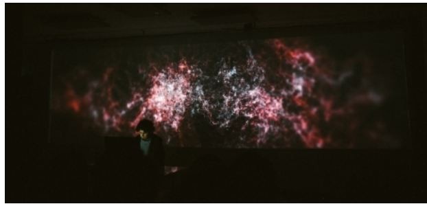
Topologies, 2017 Audiovisual, 3840