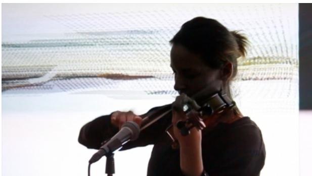
Vsig, 2016 Audiovisual, 3840