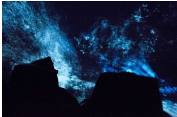
Remote Sense, 2017 Audiovisual, Full Dome