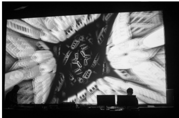
Ngons, 2016 Audiovisual, 1920