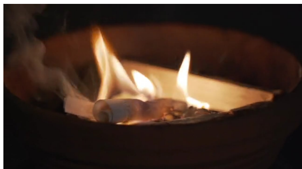
UMAD decolonizing rituals aftermovie, 2020 8:14