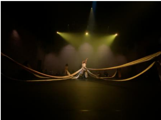
Legacy & Seeds, 2024

2013 - Cultural organiser at CLOUD/danslab Loopt nog