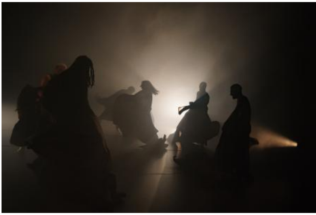
ANALEMM a decolonizing club dance ritual centering queer people of color, 2021