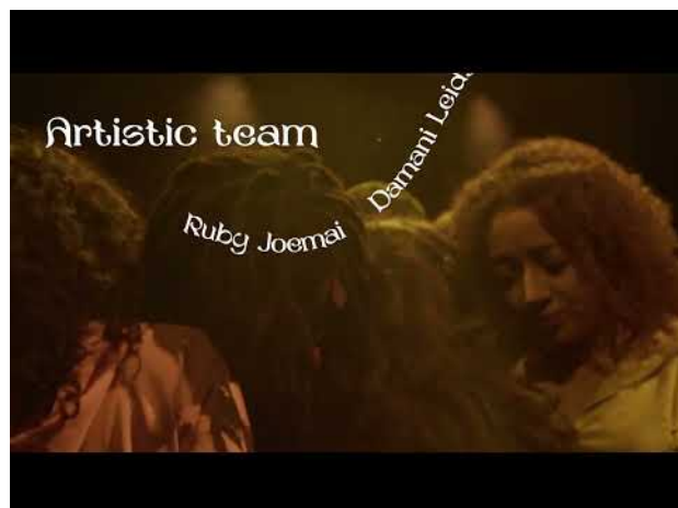
Fertile Ground / , 2023