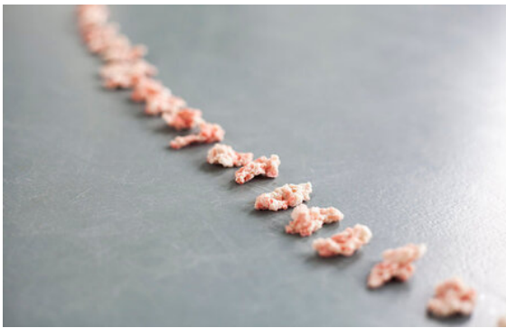
BITE CHEW SPIT, 2018 Installation