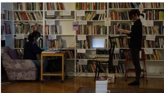
Circadian Rhythm, 2016 24 hour performance