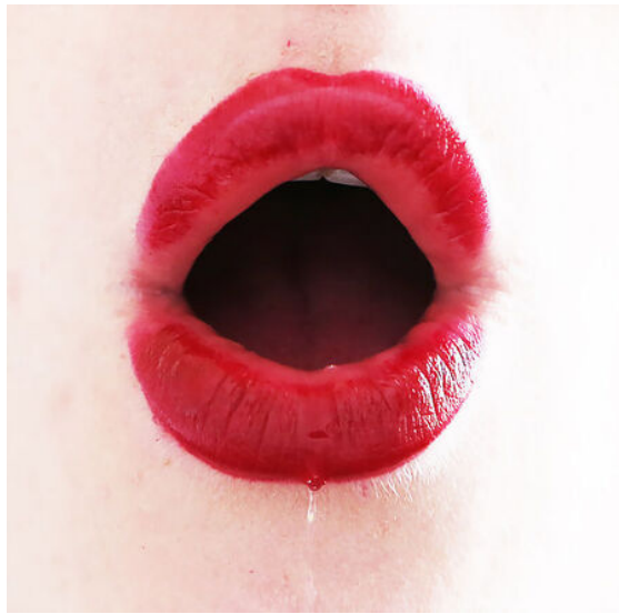
Choreography of the Mouth, 2019