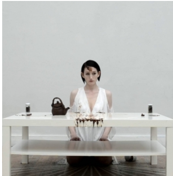
'Teaism' -the habitual act of making tea, 2016 live art performance