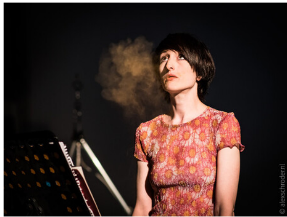
Wwwords, 2018 performance