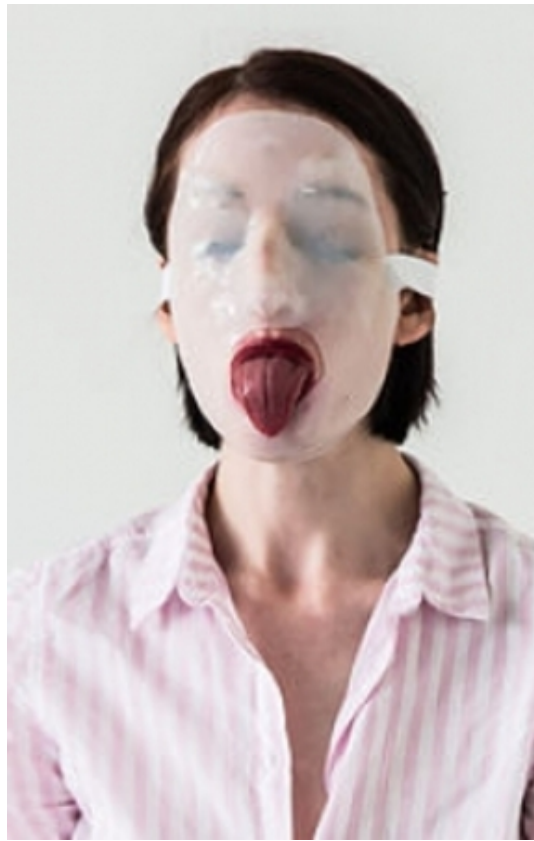
Choreography of the Mouth - Nil by Mouth, 2017 performance