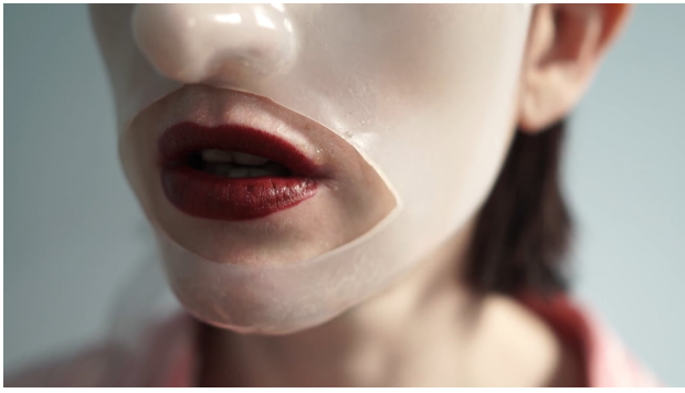
Choreography of The Mouth - Nil by Mouth, 2017 1 minutes 32 seconds