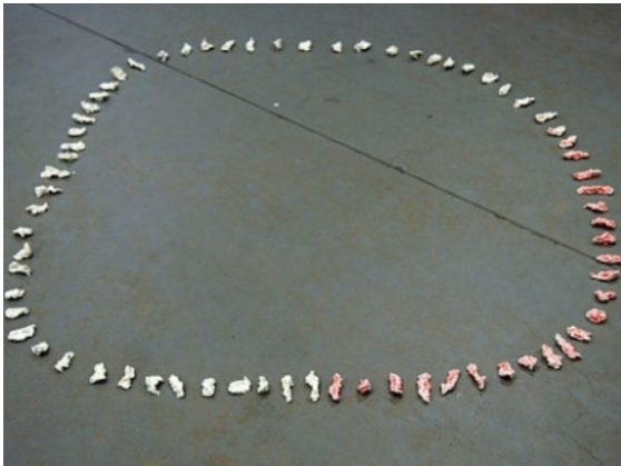
Choreographyofthemouth- BITE,CHEW,SPIT, 2017 performance, live art installation