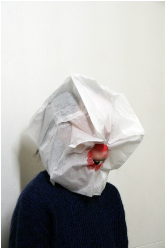
SPIT IT OUT, 2019 Performance