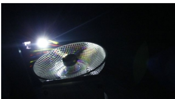
Framework, audio-visual installation, 2015 mixed media, variable