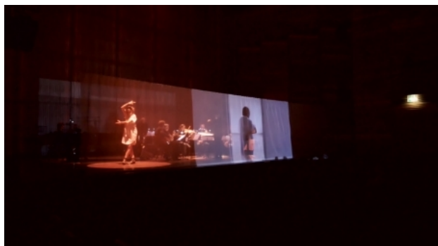
White-Gray-Black, for ensemble, video an, 2017 mixed media, variable