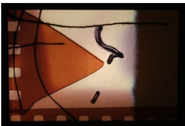
Subterranean, for two Saxophones and sli, 2015 mixed media, variable