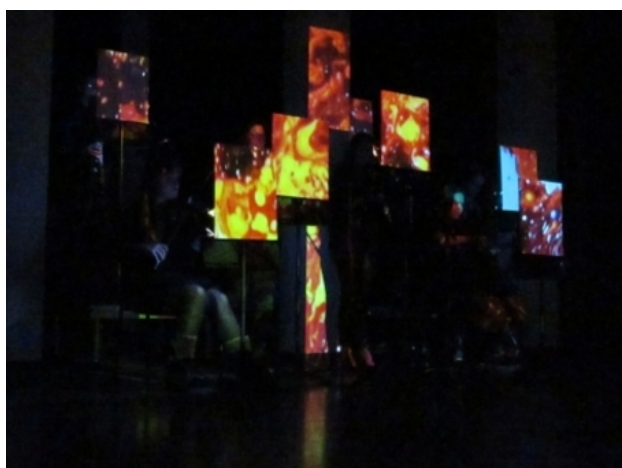
Water-prints, for Catchpenny ensemble an, 2016 mixed media, variable