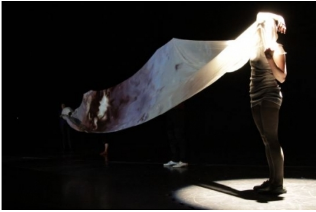
Siren-bal, for singer, tape and projecti, 2015 mixed media, variable