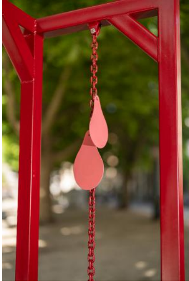
To Take the Chair and Find the Water Cold, 2025