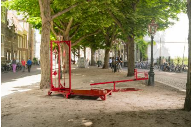
To Take the Chair and Find the Water Cold, 2025